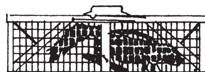
Figure 1. Live traps are the preferred way of capturing and disposing of problem skunks.