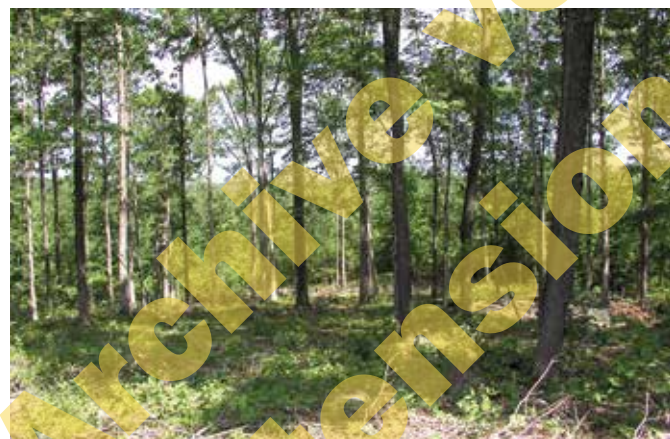
Figure 1. This stand of oaks in Bollinger County was thinned to improve growth and enhance habitat for wild turkey.

Many landowners are interested in managing their woodlands and forests not only for potential income from sales of wood products but also for enhanced wildlife habitat. This publication provides information on techniques that can be used to help make informed