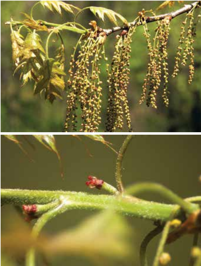
Figure 4. Oak flowers: the pollen producing catkins (top) and the short, rounded spikes on the leaf axils (bottom).

acorns are produced near the ends of twigs within the tree's crown. Oaks with crowns that are fully exposed to sunlight — that is, those trees that are dominant or co-dominant in the stand — produce more acorns than trees with crowns that are totally or partially shaded.