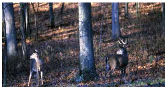
Figure 3. Oaks provide food and cover for numerous wildlife species, including white-tailed deer (above) and wild turkeys (right).