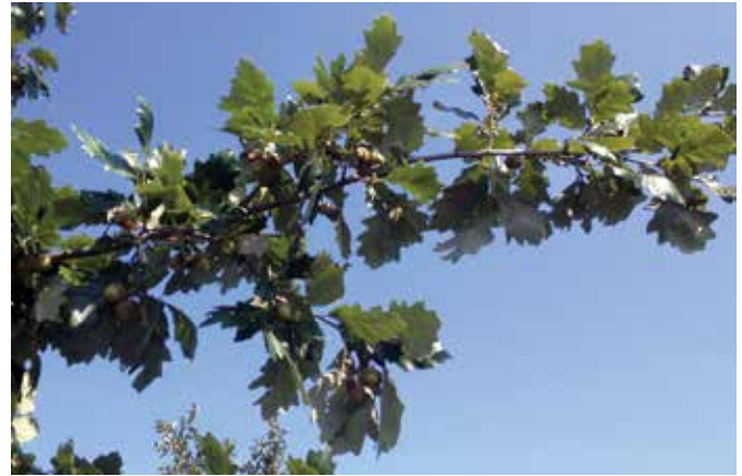
Figure 6. One way to identify good acorn-producers is to view trees through binoculars on a bright, sunny day when acorns are silhouetted against the sky.

The average number of acorns per branch was based on the terminal 24 inches of healthy branches found in the upper third of the crown.