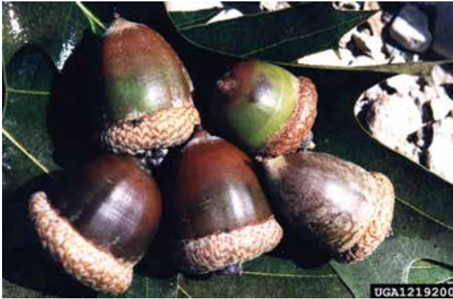
Figure 5. Acorns from white oaks (top) mature in three months and are less bitter than red oak acorns (bottom), which take 15 months to mature. Acorns from both groups provide important foods for wildlife.

a relatively small percentage of the trees within a stand will have the capability to produce an abundant supply of acorns during a given year. Research has shown that among white oaks, only about 30 percent of large, healthy trees produced any acorns even during years of good production. Research has also shown that the trees that produce an abundance of acorns can be identified and managed to increase mast production.