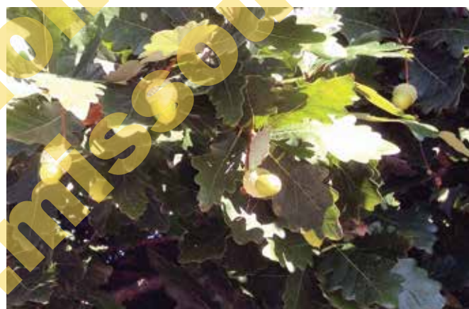
Figure 2. Acorns, a staple product of oak forests, are eaten by many wildlife species.

Oaks have female and male flowers on the same tree, but wind pollination ensures cross-breeding among neighboring trees. Male flowers are the pollen-bearing stamens on catkins; female flowers are the short, rounded to pointed spikes on the leaf axils (Figure 4). The resulting