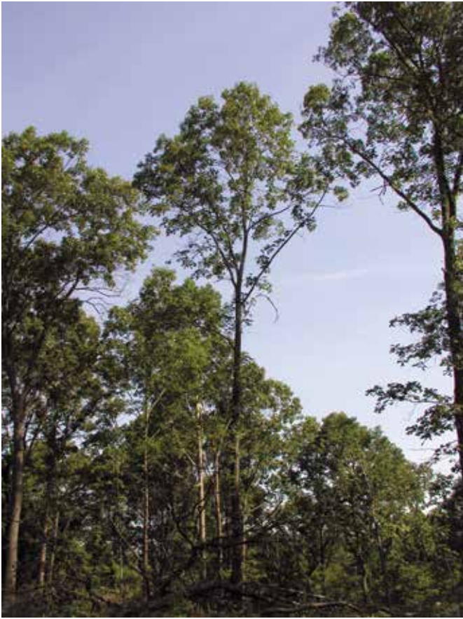
Figure 7. These oaks were the dominant trees in the canopy and were retained after a timber stand improvement practice, which encourages increased growth and acorn production.