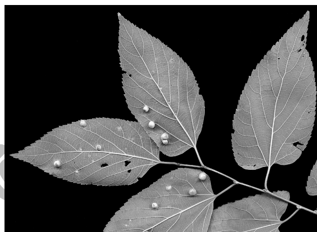
Figure 2. Nipple galls on underside of hackberry leaves.