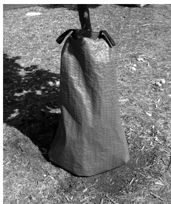
Figure 2. This product provides drip irrigation for trees through pinholes in a plastic pouch.

Besides the appearance of your plant, another way to gauge