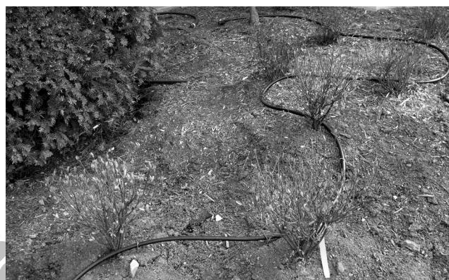
Figure 1. Drip irrigation delivers water slowly and efficiently to the root zone of plants, maintaining soil moisture in a drought.

It is common in Missouri to have above normal rainfall in April and May, leading to extended periods when the soil is saturated. These conditions, combined with the clay soils found in many landscapes, may lead to suffocation of deep roots even when plants are growing on slopes. Then, when the annual drought strikes, trees like sugar maple and pine are less capable than usual of coping with drought stress because their root systems are damaged. This situation may lead to a downward spiral in which a large tree, weakened by drought stress, is attacked by insects and diseases that normally pose little threat to plant health. Leaves may be sparse and smaller than normal, leading to a reduction in photosynthesis and a gradual starvation