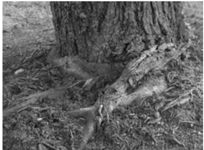
Figure 7. Girdling roots restrict the flow of sap. Poor growth or death of the tree may result unless they are removed.

Trees are occasionally injured or killed by girdling roots (Figure 7). A girdling root is one that crosses one or more other roots and begins to encircle the trunk. Such a root arrangement most often results from planting container-grown trees with circling roots. It may also result when the quality of soil in a planting hole is better than that of the surrounding soil, discouraging outward root growth. Other possible causes of stem girdling roots are planting too deeply or piling mulch around the base of the trunk. As the roots grow,