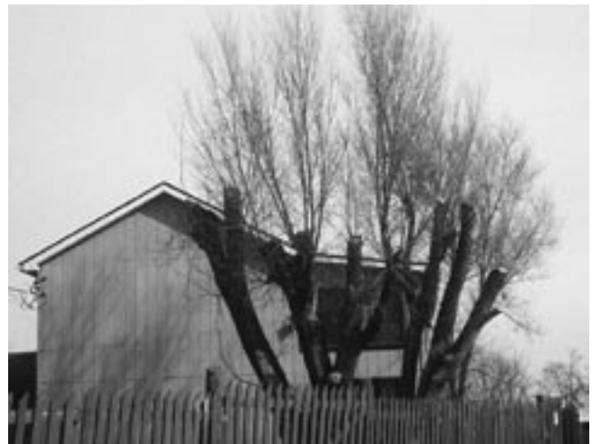
Figure 4. Topping hurts the appearance of a tree for several years and increases its vulnerability to disease, insects and storms.

Large old trees are subject to sunscald if they are heavily top-pruned. The bark may be killed when it is suddenly exposed to full sunlight. To prevent sunscald, prune only part of the tree top in any one year. If it is necessary to remove a large limb, the trunk may be protected against sunscald by painting it with light colored water-base paint. Oil-base paints may damage the bark.