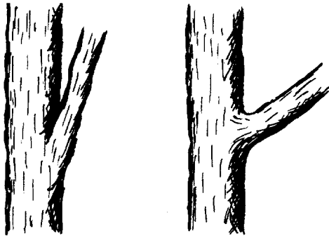
Figure 2. Choose branches with strong, wide-angle crotches (right). Branches with narrow-angle crotches (left) are weaker and should be removed.

tree. A young tree should be pruned up gradually so that the unbranched trunk is never more than one-third the total height of the tree. Thus, a tree should not be pruned up to provide six feet of clearance until it is about 18 feet tall. If it is necessary to limb up to 6 feet sooner than this for sidewalk clearance, the tree was planted too close to the sidewalk.