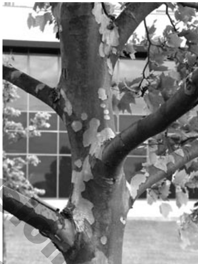
Figure 1. Scaffold branches should have good vertical as well as radial spacing.

One or two years after planting, start pruning the tree to improve its form. Select the main (scaffold) branches at this time. They should be well spaced along the main stem, smaller in diameter than the