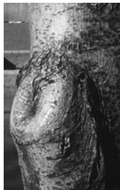
Figure 6. Pruning at the branch collar encourages formation of a callus that seals the wound and protects the tree.

must be removed by the three-step, stub-cut method to avoid tearing the bark (see Figure 5). Make the first cut about one-third of the way through the underside of the branch, about a foot from the point of the final cut. Next, cut off the branch a few inches above the first cut. The final cut should be a “collar cut” made at about a 45-degree angle along the swollen area, or “branch collar,” at the base of the branch. A collar cut makes a much smaller wound than a cut parallel (flush) with the trunk. Also, cutting a branch off flush with the trunk damages the collar, interfering with the tree’s ability to seal off, or compartmentalize, the pruning wound by producing callus tissue (see Figure 6).