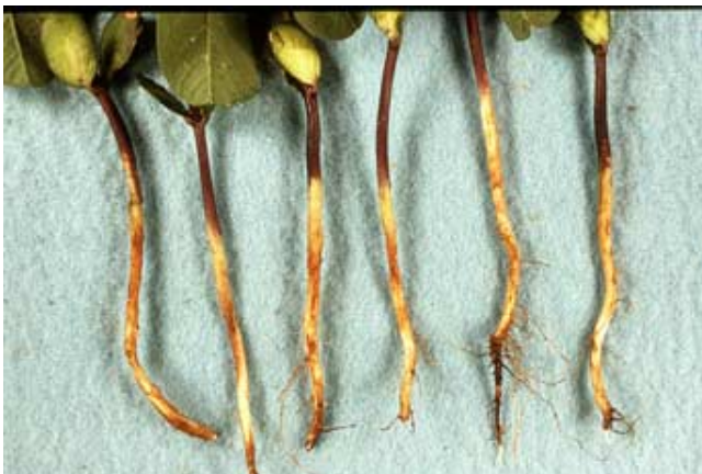
Figure 1. Lesions on soybean seedling roots are a symptom of seedling disease.

Symptoms: Dark brown or reddish lesions on the