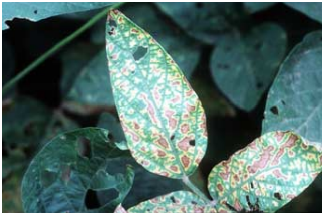
Figure 4. The first foliar symptoms of sudden death syndrome are yellow areas between veins. These areas turn brown as the disease progresses.