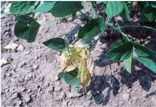
Figure 5. Brown spot, a common disease in early summer, first appears as small, red-brown spots on lower leaves.

acteristic of bean pod mottle virus infection. Plants infected by tobacco ringspot virus are often stunted, and petiole and leaf growth are abnormal. Plants can be infected by two or more of these viruses.