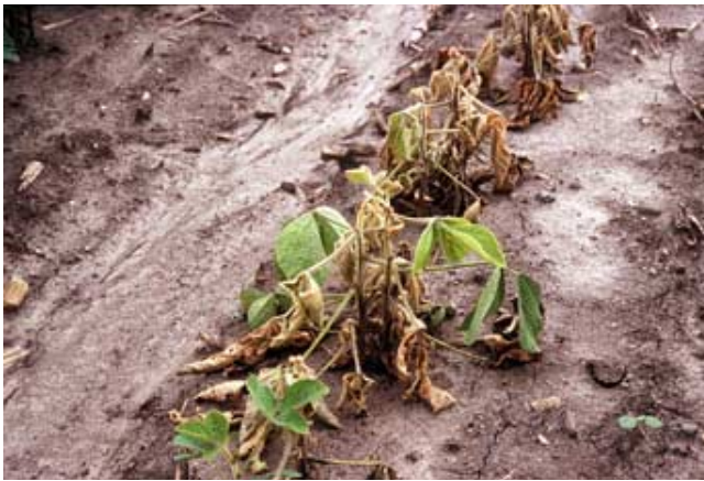
Figure 2. Phytophthora root and stem rot may cause wilting and death of leaves, which generally remain attached to the plant.

ture is low. The disease often is more severe in early-planted soybeans and in clay soils.