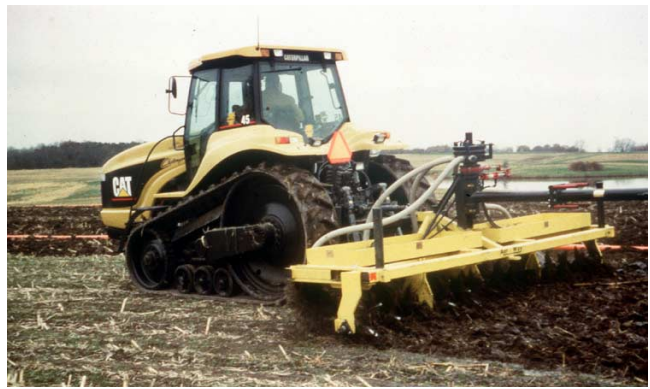
Figure 3. Liquid manure pumped from a manure storage facility is incorporated into the soil by rotating tines. This method reduces odors associated with surface application of manure.

vaporization than high-pressure and high-trajectory application. In-canopy sprinklers for center-pivot irrigators should be considered for odor reduction.