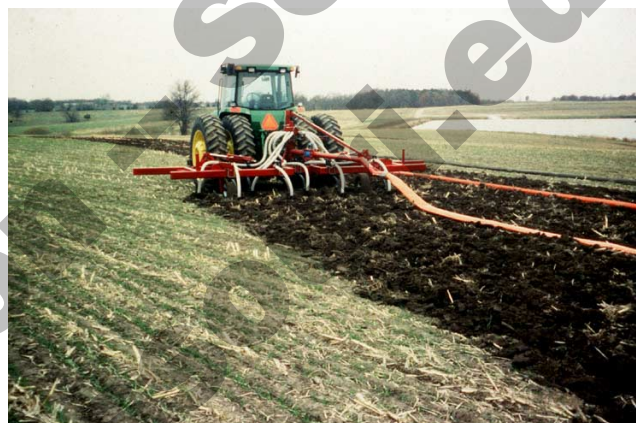
Figure 1. This hose-fed machine practically eliminates the odor from land application of liquid manure by injecting the manure into the soil.

Table 1 shows the buffer distances (the minimum distance between the nearest confinement building or lagoon and any public building or occupied residence) required by the Missouri Department of Natural Resources (MDNR).