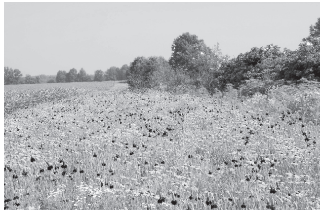
Figure 11. A field border composed of native forbs and warm-season grasses established next to a corn field.