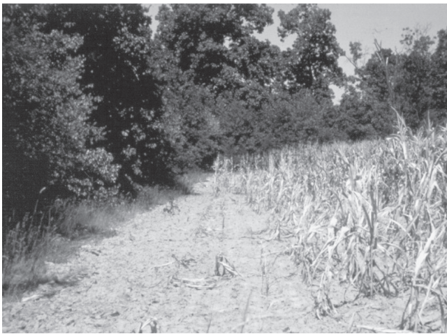
Figure 8. Farmers may experience crop losses in fields planted adjacent to mature trees.

areas were planted with crops. Another concern for crop producers is whether the potential increase of insects and weeds will result in decreased yields to the surrounding crop. Recent studies examined how herbaceous field borders around agricultural fields influence crop yields, insect abundance, farm-level economics and potential wildlife habitat.