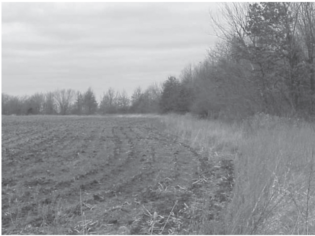
Figure 7. A herbaceous field border next to a woodland. Narrow borders can benefit wildlife, but wider is better.