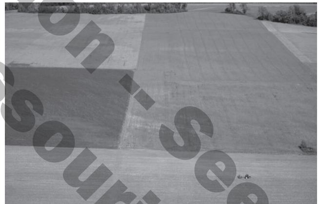
Figure 2. Many farms have eliminated field borders and fence rows.

the agricultural landscape. Practices such as disking, burning, mowing, planting food strips and harvesting timber also create opportunities to enhance areas for wildlife. Field borders can provide increased plant diversity and transitional zones of habitat around crop fields. Studies in Illinois suggest that bobwhites tend to increase in areas that have a greater quantity of edge between woody and herbaceous cover (grasses, forbs and legumes). There is ample evidence that the abundance of bobwhites in an area increases with the quantity of suitable permanent cover, which can be increased on a farm through the establishment and management of edge habitats, such as field borders.