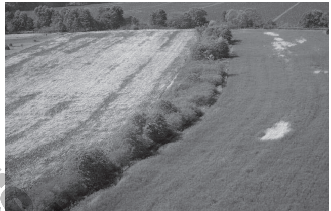
Figure 1. Field borders and fence row habitats were once a common sight around many crop fields.

On many farms, field borders may be the only areas that provide important food and cover plants that wildlife need to survive. Establishing a field border or maintaining a fence row around a crop field or pasture is one way to improve habitats for wildlife in