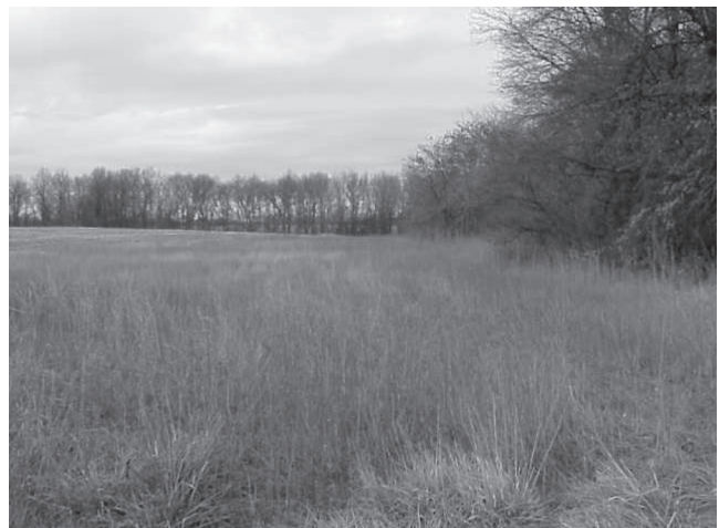
Figure 5. A field border established next to a crop field provides one type of edge habitat beneficial to wildlife.

Figures 4 and 5 provide examples of edge habitats that have been improved for wildlife. A transition zone composed of a variety of plants including grasses, forbs and shrubs provides important habitat components for wildlife. Note the wider boundary that gradually combines the characteristics of several plant communities.