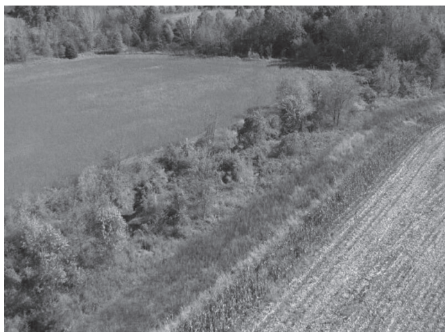
Figure 4. This wide vegetative zone between the crop field and shrubs provides higher quality habitat for wildlife.

However, in many instances the habitat created is of poor quality and lacks essential food and cover plants (such as shrubs, grass and forbs) that are important for a variety of wildlife. Figure 3 provides an example of an edge habitat of poor quality. Note the narrow edge between the woodland and crop field. In many cases, mature woodlands lack herbaceous and shrubby cover and are located next to a field that offers unsuitable habitat for wildlife for much of the year. These narrow edges often provide poor habitat and thus can be ecological traps for wildlife. In other words, wildlife may be attracted to these areas where productivity is too low to replace the level of mortality. Often, predators such as raccoons and coyotes will concentrate their hunting activities near edges because of the abundance and variety of prey animals that are attracted to this special habitat.