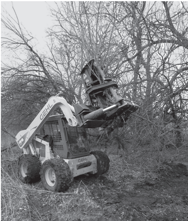
Figure 15. Field borders can be created and widened by harvesting or cutting mature trees next to a crop field, a technique known as edge feathering.