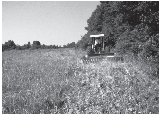
Figure 14. Strip disking can create and manage field borders.

Field borders do not have to be planted with vegetation to provide benefits for wildlife. In fact, simply allowing native vegetation to grow along the border of a cultivated field (as in a fallow field) can create valuable habitats. It will be necessary to disk or apply a herbicide to establish native vegetation if the existing field border is in a dense sod, such as tall fescue. These natural borders can be allowed to grow to shrubby cover or can be maintained by disking or prescribed fire.