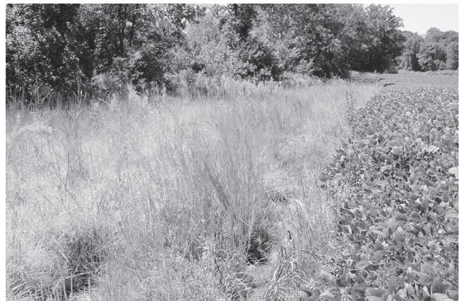
Figure 12. A 30-foot-wide field border composed of native forbs and warm-season grasses next to a soybean field.

vides a food base for many species of birds, including bobwhite quail.