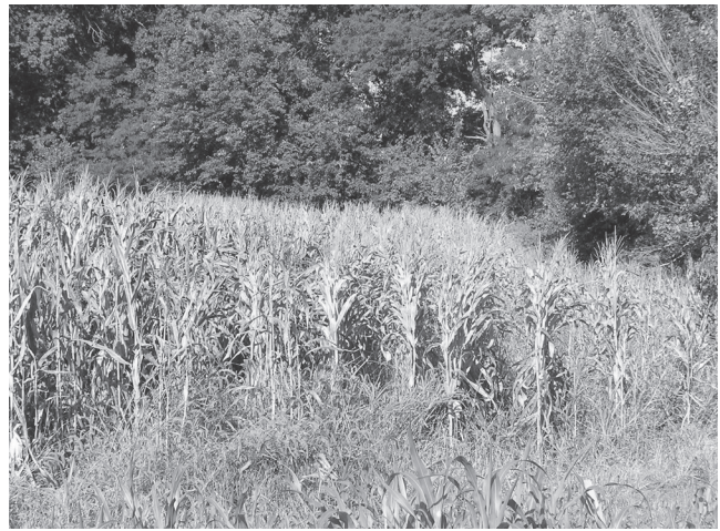
Figure 9. Shorter corn rows next to the tree line display effects of crop yield losses in a field planted next to mature trees.