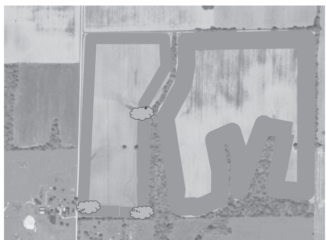
Figure 6. The highlighted areas in this aerial photo depict locations to establish field borders on the farm.

The habitat provided in these wider areas provides a better chance for wildlife to reproduce and survive.