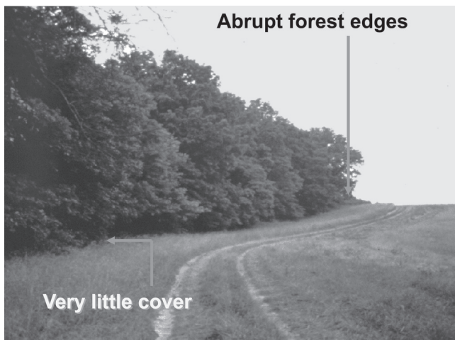
Figure 3. Narrow, abrupt edges provide little plant diversity and poor-quality habitat for wildlife.