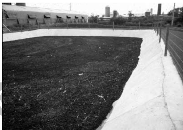
Figure 1. A concrete-lined earthen pit may allow the use of steeper side slopes, which decreases the area required per unit of storage volume. It also provides a more pleasing appearance.

Ideally, earthen pits should be located lower than the manure source so that liquids can drain by gravity to the pit and wastes can be flushed to the pit by gravity. If wastes are scraped into the pit, proximity to the source