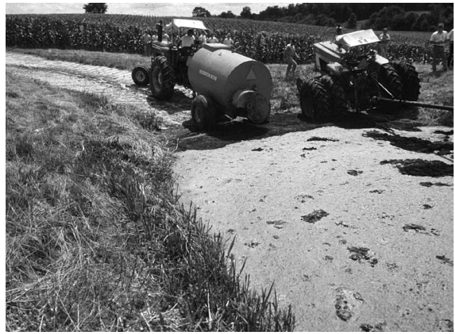
Figure 5. A concrete ramp allows all-weather access to the pit.