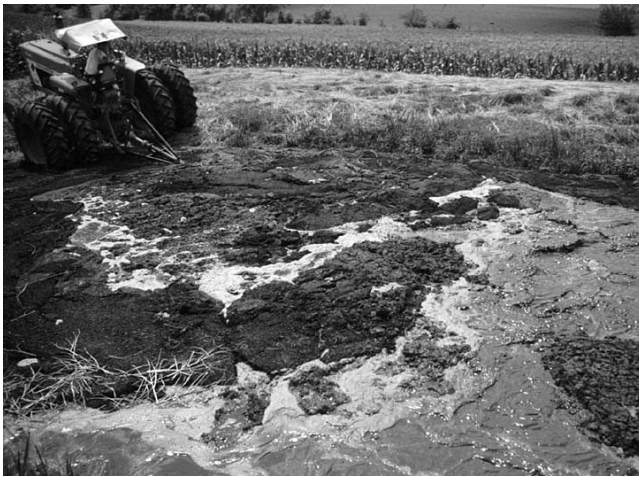
Figure 4. Agitation of a pit with a propeller-type, 3-point mounted agitator.