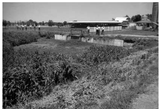
Figure 3. Without agitation a pit can become overgrown.

Agitation is accomplished by using high-horsepower, propeller-type agitators (see Figure 4) or by recirculation with high-capacity pumps.