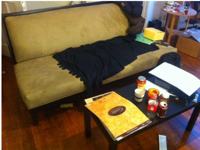
Figure 9. A couch, obviously a place for socializing.

Throughout all study spaces, electrical outlets were valued highly. Particular care must be taken to provide electrical access for open group areas because these spaces are prone to spontaneous