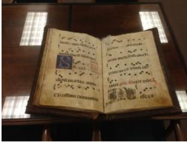
Figure 6. “Something every Conservatory freshman should know about the library”: a medieval chant book in special collections.

Along similar lines, a student selected the Marr Sound Archives, and elsewhere in the interview noted listening to particular pieces there. The final student photographed music periodicals, and explained: