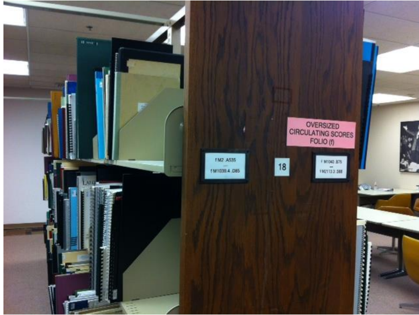
Figure 4. The oversize scores section, where a student intentionally browsed for compositional ideas and inspiration.

Subject: When I need new ideas, I just go to... this shelf, and randomly check the piece, and, like, ah-ha, maybe this one, this one, and bring them home and study.