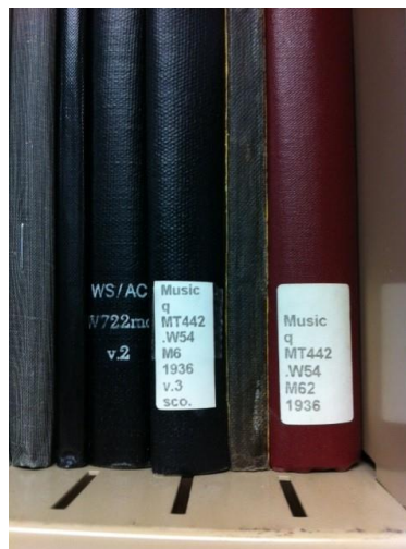
Figure 2. "Something every Conservatory freshman should know about the library": How to read call numbers.

Though students valued the browsing experience classification provides, learning about and utilizing classification presented difficulties. One student selected the ability to read call numbers (though the student didn't know the term "call number") as "Something every Conservatory freshman should know about the library" (Figure 2).