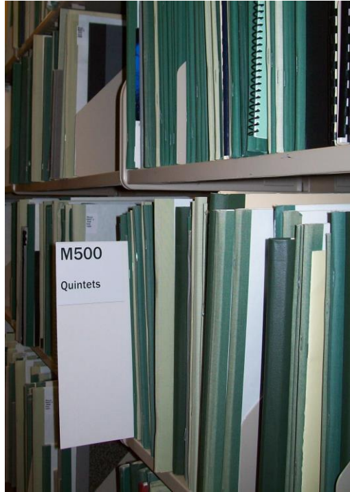
Figure 14. A sign filed within the physical notated music collection for way-finding and passive education regarding classification.

Student preference for non-library sources for recordings stands in contrast to the situation for notated music. This difference is due to the excellent library browsing experience provided for notated music (primarily through physical stacks), in comparison to a problematic browsing experience for recordings. This preference serves as a call to increase functionality in online browsing and discovery options for recordings, whether these online options are OPACs, discovery tools, databases, or something else. Such improvements could also enhance the discovery experience for notated music by providing online options in addition to physical browsing. Libraries might also consider providing physical browsing experiences for recordings, though classification (particularly Library of Congress classification) can be problematic because many CDs contain works which fall into different class numbers.