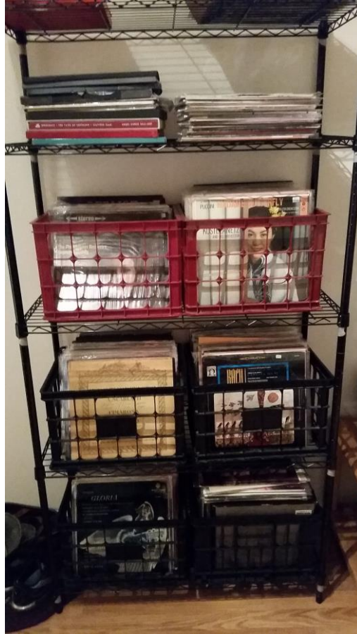
Figure 5. Discovering new music by browsing a friend’s LP collection.

In contrast to online browsing experiences as well as the above student’s experience physically browsing LPs, UMKC, like many academic libraries, keeps all recordings in closed stacks 32 and so does not provide students a physical browsing experience for audio and video. Students must locate recordings via the library catalog, which, while an adequate tool for locating known works, does not facilitate serendipitous browsing in the ways websites such as YouTube or Spotify do. Because students valued browsing, it is not surprising they chose sources with more robust browsing options. 33