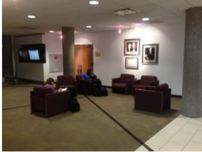
Figure 12. “A place where you socialize”: gathering area near ensemble rehearsal room.