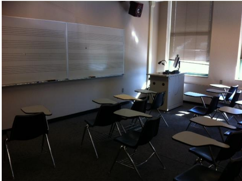
Figure 13. A student immediately identified the window as a feature of “A classroom you like.”

Students spend a great deal of time in classroom spaces. Subjects in this study consistently expressed a preference for natural light in classrooms. In fact, three subjects (half of those interviewed) mentioned natural light as a positive characteristic of classroom space, and a fourth subject noted a preference for a well-lit dance studio over more dimly-lit dance studios. However, this preference should not be transported unquestioned into all library and study spaces, as evidenced by one student's explanation of a difference in lighting preference between an individual work space and a classroom (Figure 13).