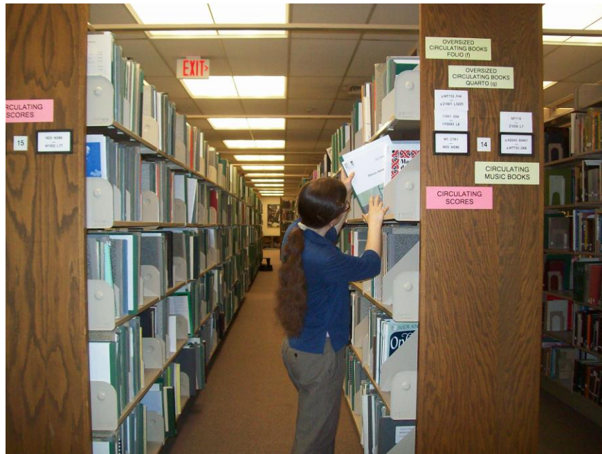
Figure 3. Tipping volumes out to check the call number in long rows of thin, pamphlet bound materials.

Subject: It would be nice if there were a little thing that simply said, "Woodwind Quintets." ...and I could go over there and look through the section, look at all the stuff and like, "Oh, this one looks interesting."