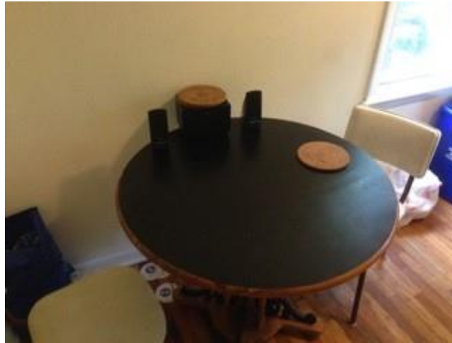
Figure 11. A table with small but “decent” speakers is “A great place to listen to music.”

Subject: It depends on who is in the house... Sometimes, if my roommates [other music students] are home, we'll listen to music... If it's just me, I'll listen to music.