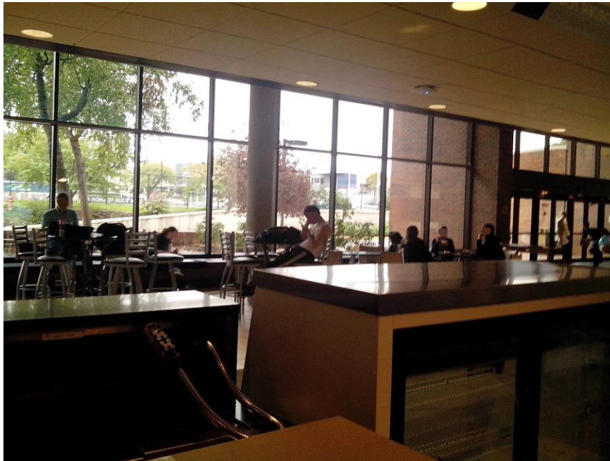
Figure 10. “A place where you socialize”: an open lobby in a conservatory building.

rearrangement and students are frequently seated away from walls, where electrical outlets are most standardly located. One subject photographed an open lobby in a conservatory building, and identified it as a place for regular socializing (Figure 10), but pointed out the problems created by insufficient number of electrical outlets. Though the student's photo provides a good view of numerous students in a pleasant, open space, the viewpoint is significant because the student took the photo while studying, standing up, near a drinking fountain where an electrical outlet was located. The student quickly identified addition of electrical outlets as the chief way to improve the space: