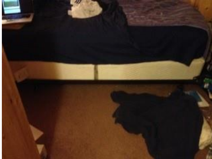
Figure 8. A secluded bedroom corner, which one student selected as a place for intense focus.

shared "living room" type space]. So, it's like, if I really need to focus on learning something that I've forgotten or getting ready for a test, or learning- doing something specific, I'll go there since it's really private and everything.