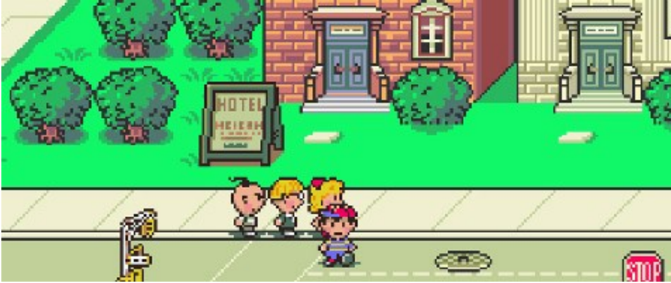
Figure 3.2 Earthbound . Ness, facing front, stands outside a hotel with his friends, Poo, Jeff, and Paula.

Composers Hirokazu “Hip” Tanaka and Keiichi Suzuki worked together to create the music for Earthbound . Next to Koji Kondo, Hip Tanaka was the most influential composer and sound designer in Nintendo’s early days. He was a self-taught musician and studied engineering at university before applying and taking a position at Nintendo. After working on the sound design for some of Nintendo’s earliest arcade hits, Tanaka went on to compose the music for some of the Nintendo Entertainment System’s greatest games, including Duck Hunt , Kid Icarus , and Metroid . 16