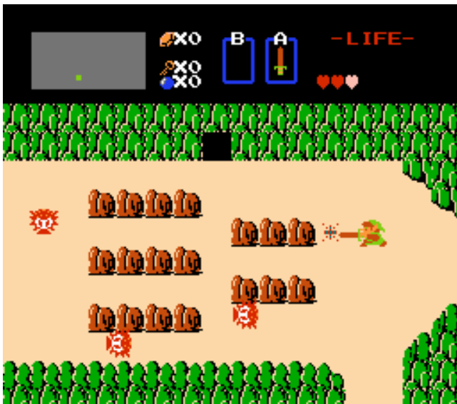
Figure 4.1 The Legend of Zelda . Link swings his sword on the Overworld map.

imitative countermelody. Both are underpinned by rhythmic triangle bass and noise channels. The noise channel emulates the patterns one might find in a marching band snare drum. Though it is set in a firm B-flat major, the theme has enough harmonic interest to sustain extended listening, an especially important facet since the open-world gameplay leaves the amount of time players will spend with the theme unpredictable. The first full phrase descends through borrowed chord harmony from B-flat to A-flat, G-flat, and F. The mode then switches temporarily to B-flat minor, before a dominant C chord turns the key back towards B-flat major. The second period maintains the same harmonic structure, but with added contrapuntal lines from the second pulse channel and some variation in the bass.