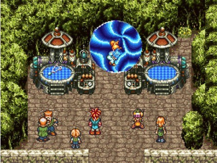
Figure 3.1 Chrono Trigger . Crono and Lucca watch as Marle is sucked into the time portal.

Mitsuda wanted his score to match the epic narrative created by the game designers. “I wanted to create music that wouldn’t fit into any established genre... music of an imaginary world. The game’s director, Masato Kato, was my close friend, and so I’d always talk with him about the setting and scene before going into writing.” 6 The scope of the game was indeed a challenge. Mitsuda needed to create music which enhanced the main characters and represented several different time periods. Adding to this complexity is the relative freedom which the programmers gave the player combined with innovative design techniques. Players can choose to explore areas “out of order,” even though the story cannot