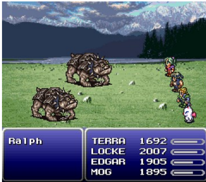
Figure 2.1 Final Fantasy VI. The heroes on the right, face off against menacing enemies in the battle screen. Pictured from top to bottom are Terra, Locke, Edgar, and another companion named Mog.

Summers further elaborates on music’s impact on game narrative: