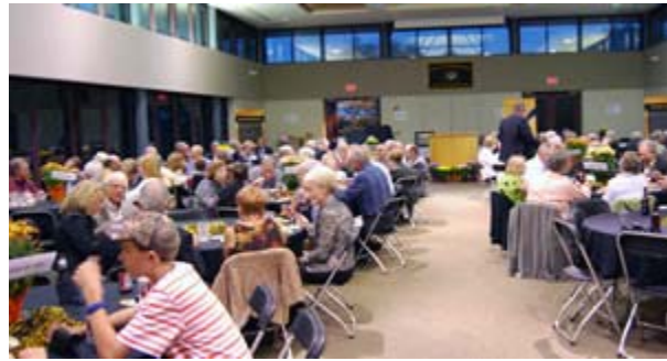
The well-attended Alumni Reunion Weekend banquet was held in Adams Conference Center.