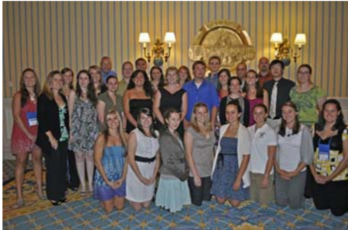
Participants in the MU CVM Veterinary Research Scholars Program pose for a group shot taken during a break from the symposium held at the University of Florida.

To make the most of their limited time, students eagerly begin developing their projects, meeting with their mentors, and attending a weekly "Foundations in