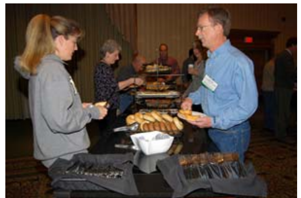
The College of Veterinary Medicine hosted a breakfast for alumni during the annual MVMA convention.