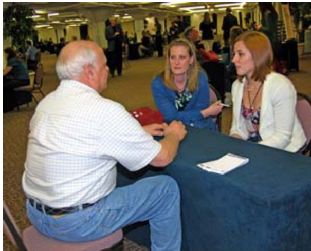
The speed networking session allowed veterinary students to meet with practitioners to discuss future job possibilities and gain insight into advancing their careers.