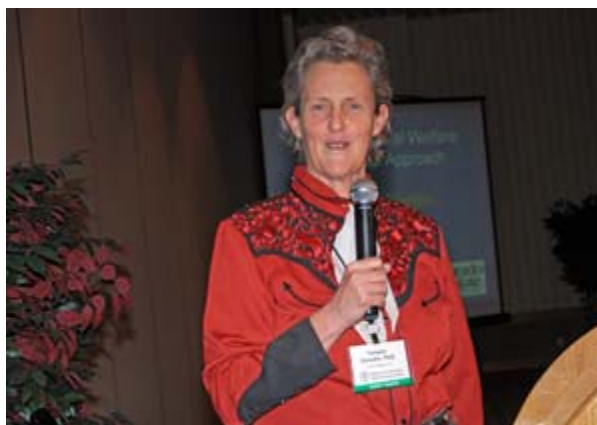
Animal scientist Dr. Temple Grandin served as the keynote speaker during the MVMA Awards Banquet.