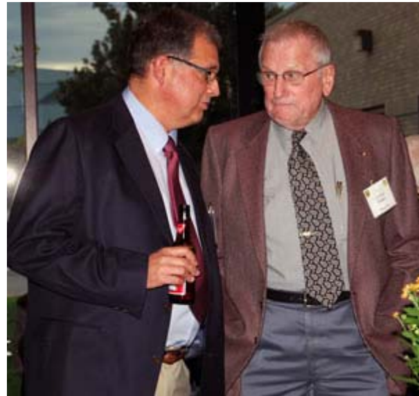
The weekend offered guests the chance to catch up with their former classmates.