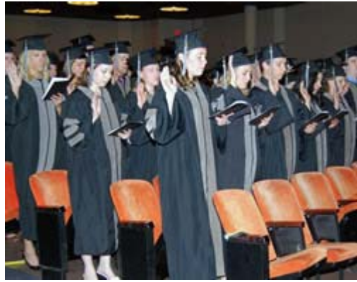
Graduating DVMs recite the Veterinarian's Oath.