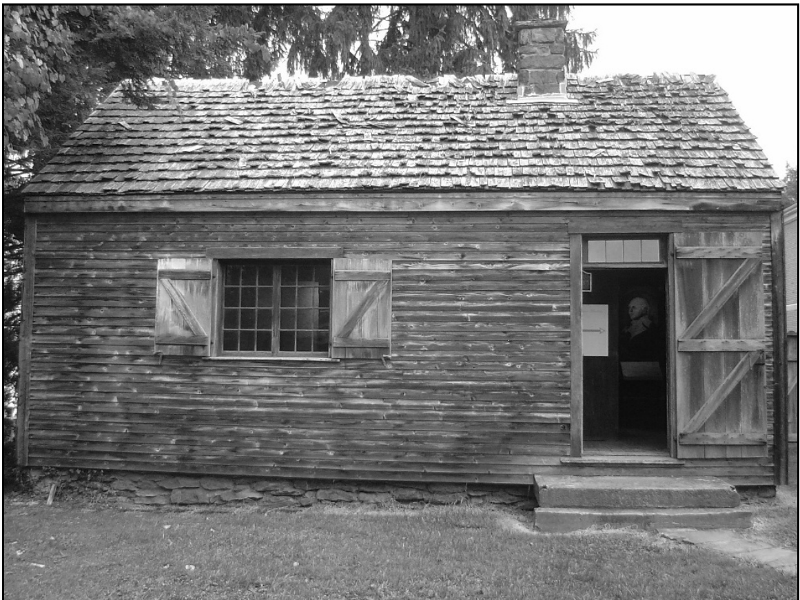
Figure 1: The Marietta Land Office, which now sits north of Washington Street at the Campus Martius Museum. The cabin has been remodeled multiple times over its 200-plus years, one of which saw the addition of the large glass windows seen here.

physically imposing military sites or even Indian mounds nearby, Murrin's interpretation encourages historians to consider the land office cabin a true midget among giants, physical proof of a puny government presence in the vast expanses of the trans-Appalachian West. For them, the office might be among the oldest extant American buildings in the former Northwest Territory but it is a piece of trivia, an insignificant part of an unimportant government.