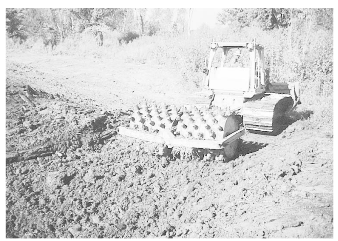
Figure 1. A sheepsfoot roller provides the high degree of compaction often necessary to seal permeable soils at a pond site.

chiseling the entire pool area, then recompacting with a sheepsfoot roller. This will help to break up the vertical structure of the soil and greatly slow leakage.