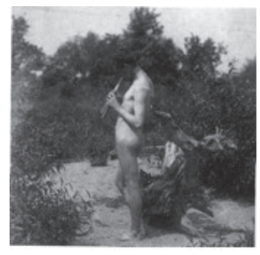
Fig. 13. Photographic male study for Arcadia .