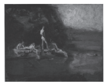
Fig. 9. Oil Study for The Swimming Hole , 1883.

The painting shows all the male figures with no trace of clothing and yet, for whatever reason, Eakins has not painted any genitals. The central figure atop the pier becomes androgynous, if not more effeminate in posture, and the protrusion of the figure's buttocks is the focal point of the painting. The men