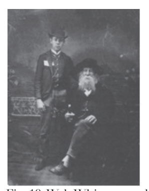
Fig. 10. Walt Whitman and Bill Duckett, 1886.