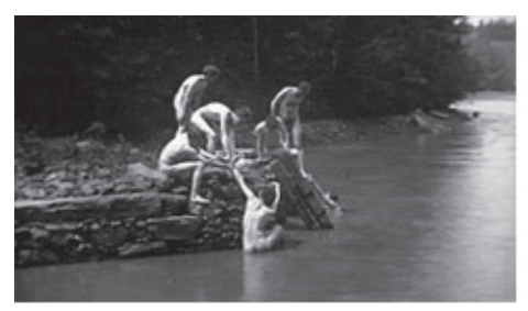
Fig. 4., Photo study at Dove Lake for The Swimming Hole , 1883.