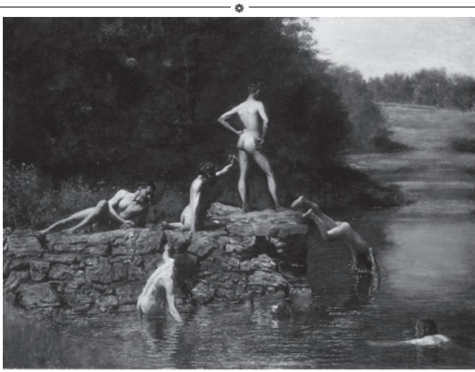
Fig. 1, Thomas Eakins, The Swimming Hole , c. 1883-85. Oil on Panel.

The Question of the Homoerotic in Thomas Eakins' The Swimming Hole