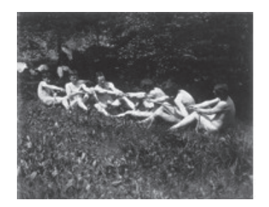
Fig. 8. Males Nudes in a Seated Tug-of-War, 1883.