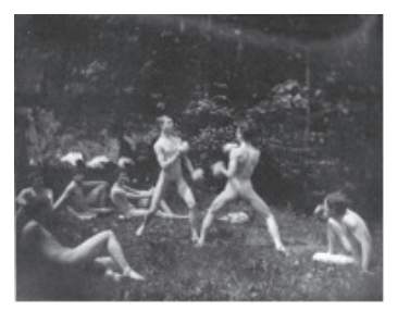
Fig. 5. Seven Males, Nude, Two Boxing at Center, 1883