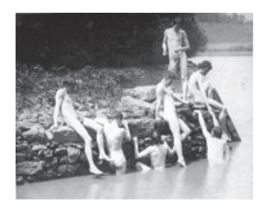
Fig. 3. Photo study at Dove Lake for The Swimming Hole , 1883.

In the photographs at the scene of the painting the men interact and engage one another; this involvement with each other is also evident in his preliminary oil sketch (fig. 9). Yet in the final painting of the Swimming Hole the figures no longer seem to interact or even look at each other, except for Eakins watching from the corner. For whatever reason, Eakins' photograph and oil studies of the men, not only aware of one another but physically interacting with each other, were abandoned. In the end, the image is of the men disengaged, if not unaware of each other's presence, that is, except for Eakins alone in the water.