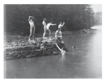
Fig. 6. Photo study at Dove Lake for the Swimming Hole, 1883.