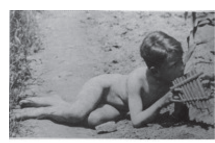
Fig. 14. Photographic male study for Arcadia .