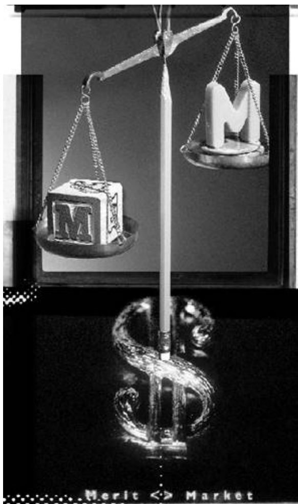
Illustration by John Weber.

It is too hard to judge individual contributions to output, too difficult to identify what teachers must do to improve. But these arguments ignore the widespread use of performance incentives in