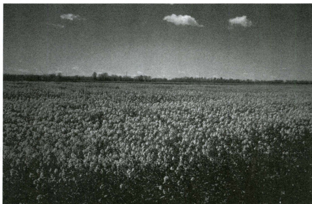
A field of canola in full bloom in early April.

and is seeded early in the fall, with two leaf-like cotyledons emerging 5 to 10 days after seeding.