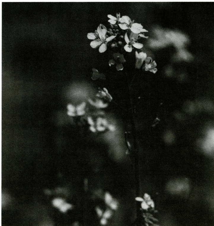
Single stalk of canola showing flower and pod development.

Before harvest, the combine should be checked thoroughly for any small holes in the grain table, grain tank, and augers. Holes can be fixed with either duct tape or a caulking compound. Combine cylinder speed, grain table reel speed and ground speed should be reduced to minimize shattering losses and to handle the large volume of material. The concave should be set to allow the crop to be threshed without breaking up too much of the stem. Excessive threshing of the stems will cause the sieves to be overloaded and result in improperly cleaned grain.