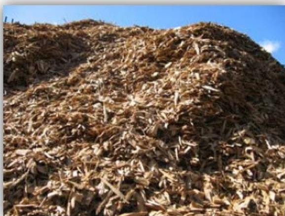
Crop waste

Although this coal-powered plant does, in fact, have a large impact on the environment, for now it is the campus' main source of energy, so without it, there is no University of Missouri. From their intensive research and development with biomass fuels to their community outreach and education, the MU Power Plant is headed in the right direction to becoming a "greener" plant.