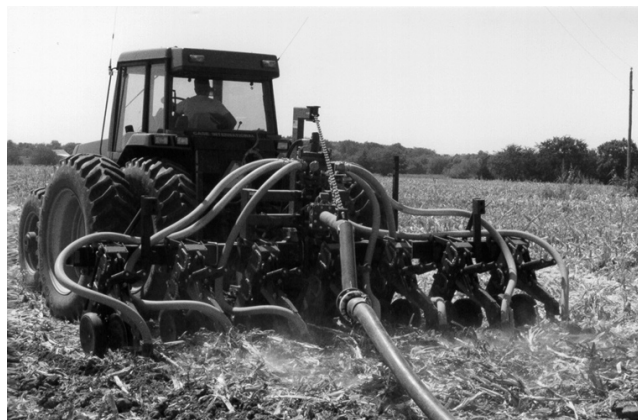
Figure 2. Injecting manure as a fertilizer for crop production.

Biochemical oxygen demand (BOD) is a measure of the amount of oxygen required to degrade organic