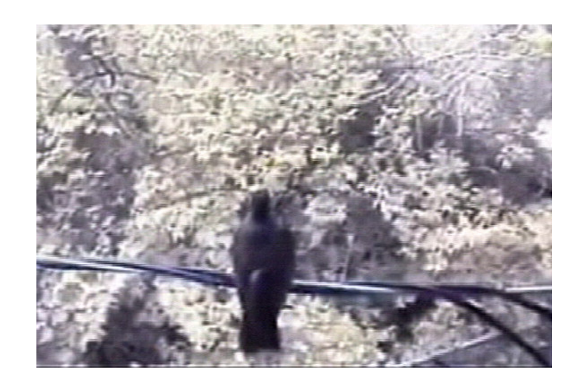
Plate 7 Exclusion (Screen Shot)