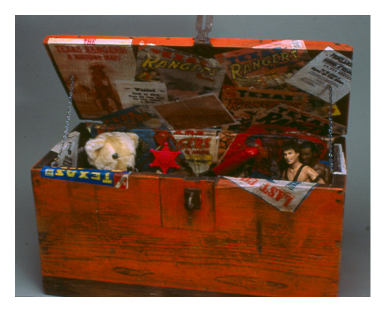
Plate 4 My Toy Box