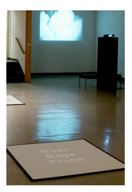
Plate 5 Walk In My Shoes (Installation View)