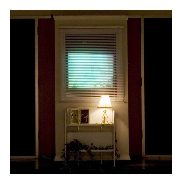
Plate 7 Exclusion (Installation View)