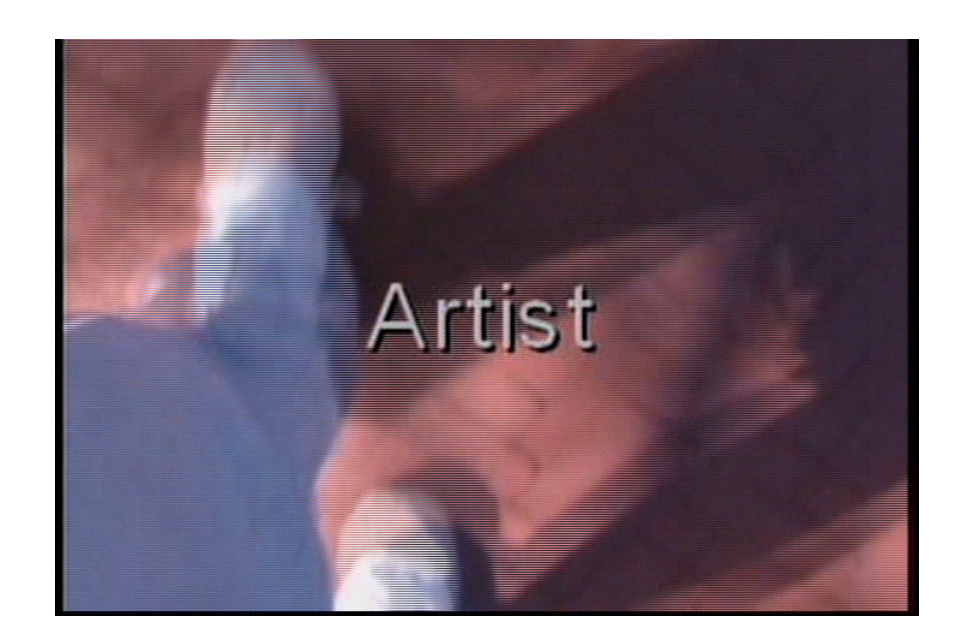
Plate 5 Walk In My Shoes (Screen Shot)