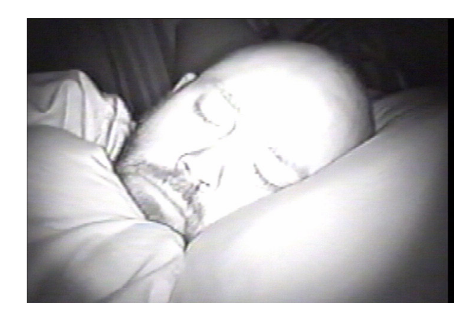
Plate 8 Journey (Screen Shot)