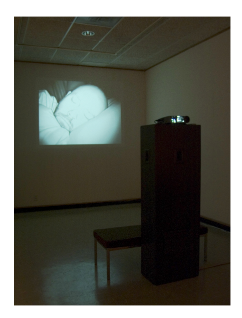
Plate 8 Journey (Installation View)