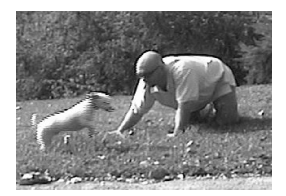
Plate 9 7 Days (Screen Shot)