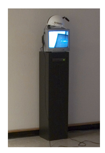
Plate 6 GAYMANCAM (Installation View)