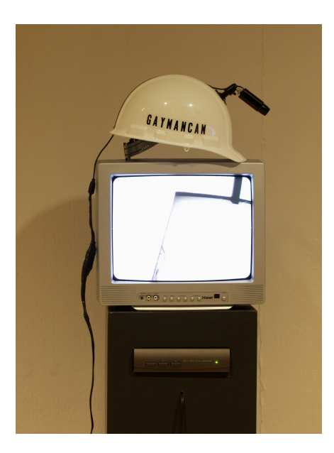
Plate 6 GAYMANCAM (Detail View) 14