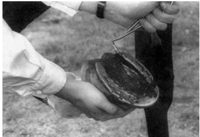
Figure 4. Use the hoof pick in a downward motion toward the toe.

raises its head too high, the strap can cut off its air and cause it to pass out.