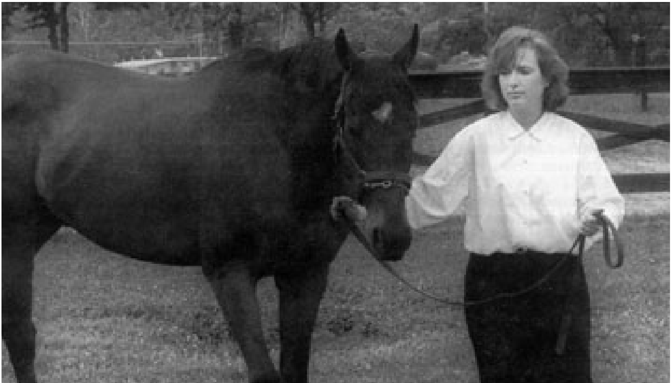
Figure 1. Always turn the horse away from you to prevent being stepped on.

more readily than nylon if the horse becomes entangled. After you remove the halter, make the horse stand quietly for several seconds before letting it go completely. This will help prevent the horse from developing a habit of bolting away and kicking at you in the process. Make sure you have an escape route in case the horse spins around and kicks out.