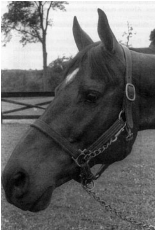
Figure 2. When not using the lead shank as a restraint, put it through the bottom and left halter rings and attach it to the throatlatch ring.