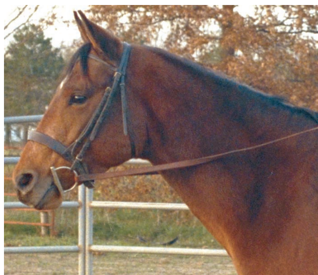
Figure 1. A bridle consists of a bit, reins and headstall.

If the bit is too wide, the mouthpiece protrudes beyond the lips. It will slide back and forth in the horse's mouth and result in confusing rein signals. Also, if the mouthpiece is jointed, it will put extra pressure on the outside corners of the bars and cause pain.