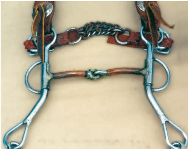
Figure 4. Jointed-mouthpiece curb bit.