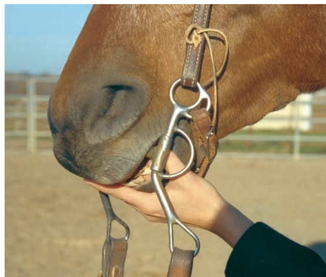
Figure 7. To get the horse to take the bit, you may need to insert your thumb in the horse's mouth behind the incisors.