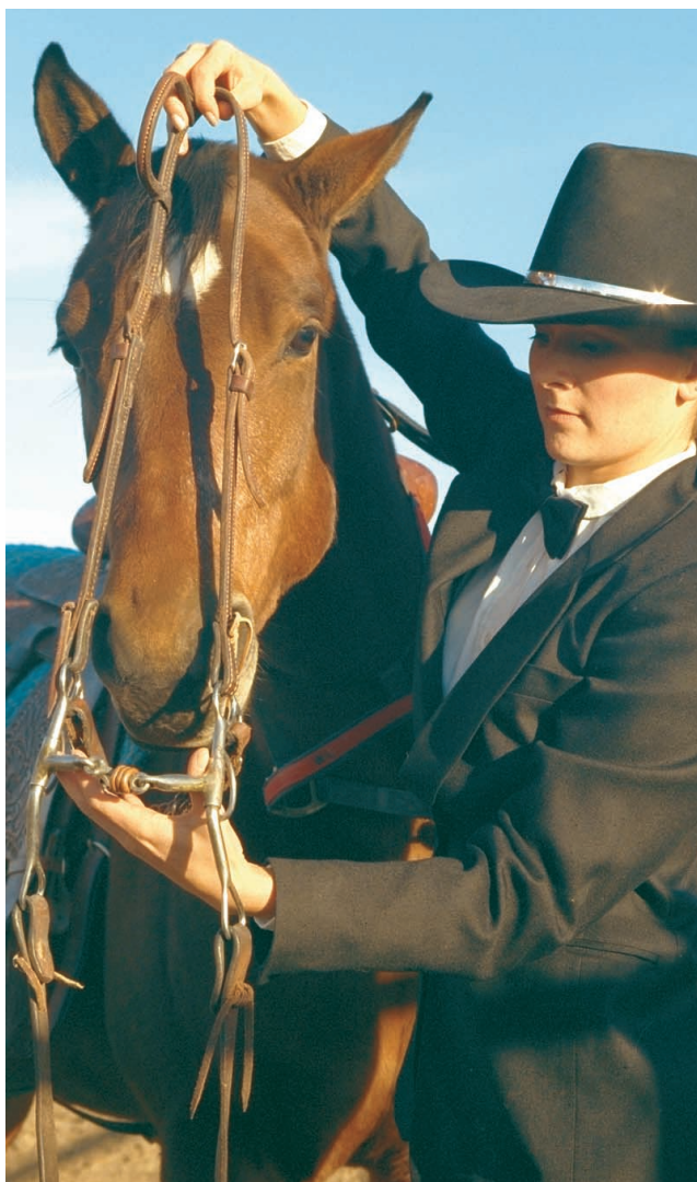
Figure 6. To maintain good control over the horse during bridling, place your right arm around the horse's neck and up between the ears to grasp the crownpiece of the bridle

Holding the bridle up with one hand leaves the other hand free to slip it onto the head. Fold the ears forward carefully one at a time. Slip them gently under