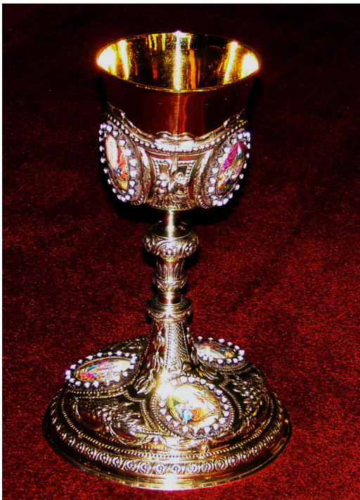
The chalice used in celebration of the Eucharist dates from the late 1600s and was a gift to this group of Saxon immigrants from Saxon count, Count Von Einsiedel.