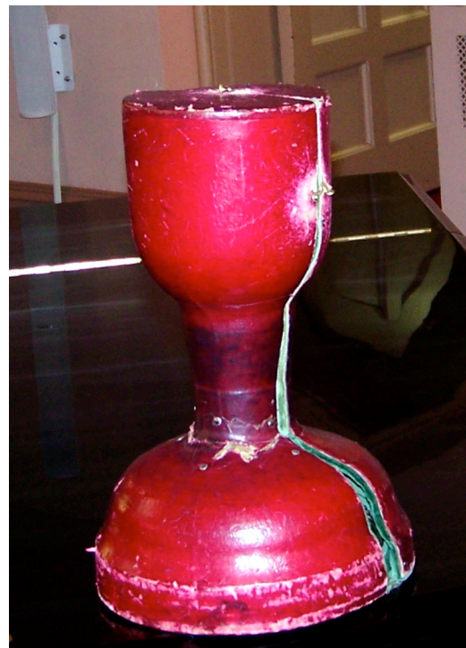
The original transportation case that houses the chalice is made of wood and leather and is still used to hold the chalice for storage.