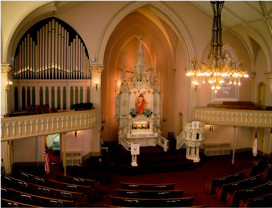
A photograph taken on April 30, 2008, of the interior of Trinity Lutheran Church (from the balcony) built in the Soulard neighborhood of Saint Louis, Missouri, in 1864. In the bell tower, the original wood pulleys were left mounted on beams of the church structure from when the bells were originally hoisted into position during the 1800s.