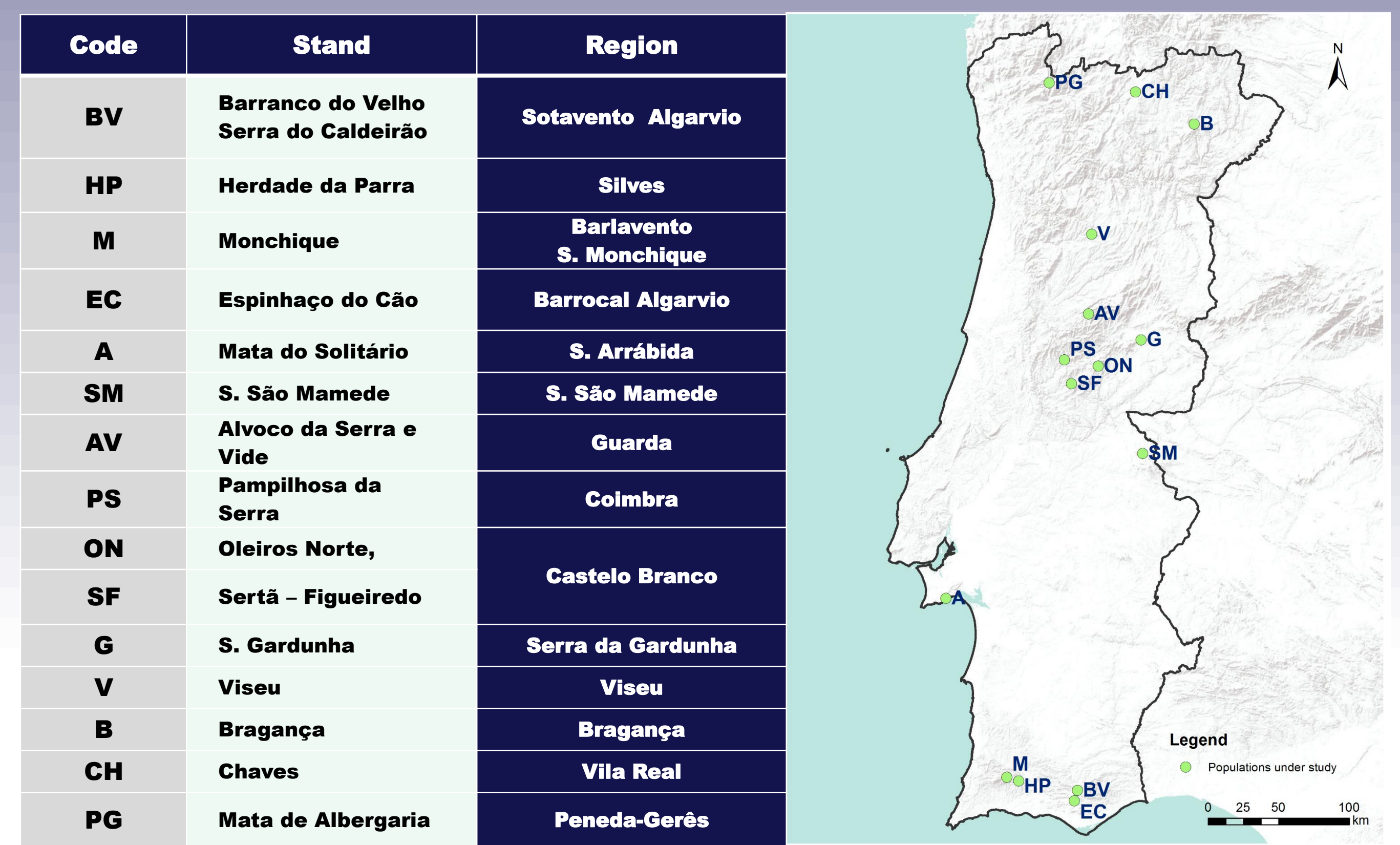
Fig. 1. Location of the 15 strawberry tree stands.

The strawberry tree ( Arbutus unedo L.) has potential to be a successfully businesslike culture in Portugal and southern Europe, where it is well adapted to climate and soils. In Portugal this species has been used by local populations for fruit consumption and spirit production, but remains largely a neglected crop. It has different possible commercial uses, since processed and fresh fruit production to ornamental, pharmaceutical and chemical applications, due to the phenolic acids and terpenoid compounds with strong antioxidant activity, vitamin C and tannin content. In addition, due to its pioneer status, it is valuable for land recovery and desertification avoidance, besides being fire resistant. Currently, the demand for improved plants has strongly increased.