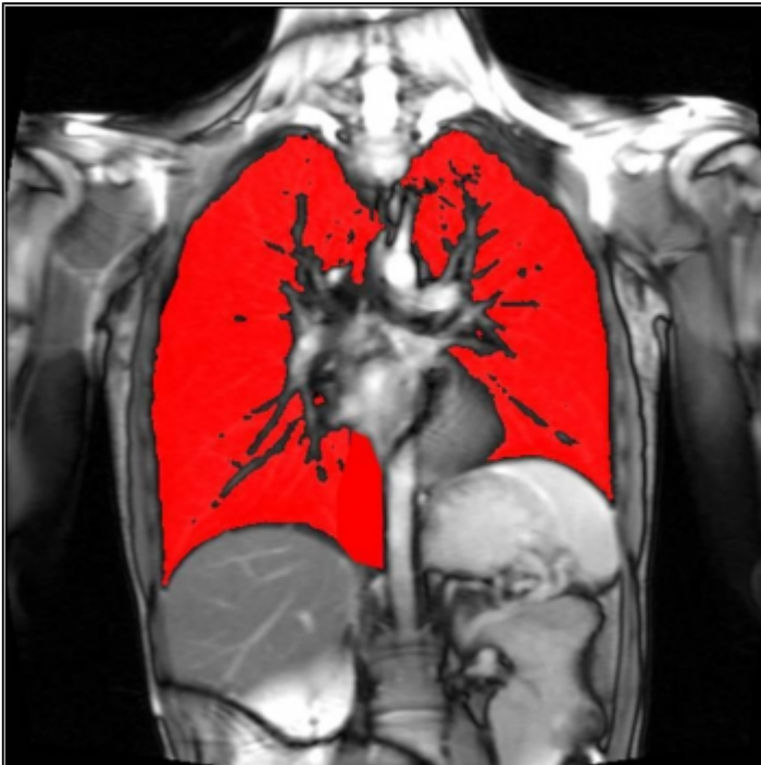
Figure 2 Functional MRI

Coronal True FISP MR image of the thorax (TR: 337ms, TE: 1,33ms) in maximum inspiration showing the segmented lung areas (red color) of both hemithorax.