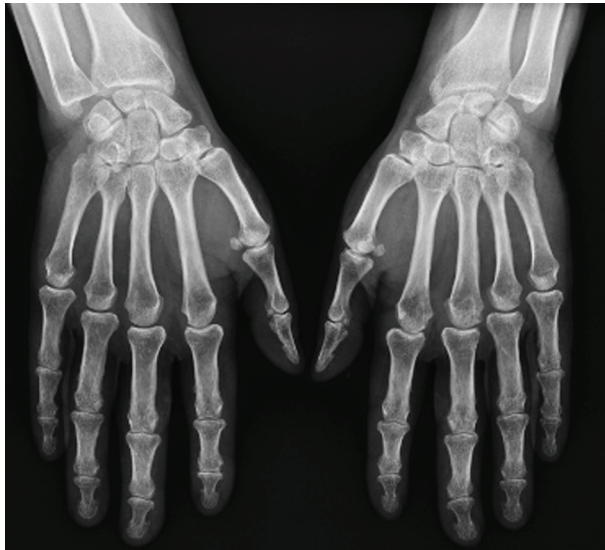
Figure 1 Radiography of hands revealed no erosive lesions, only juxta-articular osteopaenia.

On physical examination, she had arthritis of both wrists and symmetrical polyarthralgia of multiple MCF joints. Remaining physical examination was unremarkable, without any skin changes.