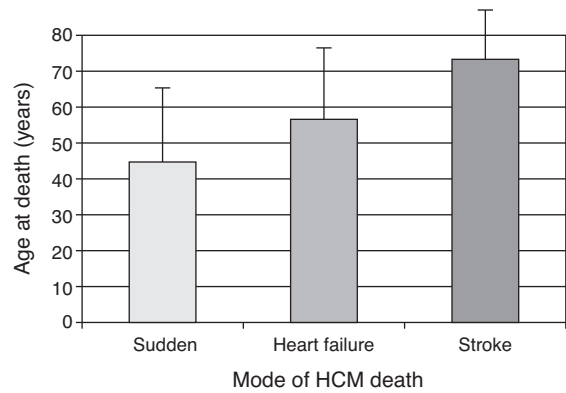
Figure 2 Mode of HCM death according to age. 3

In 2009, using a definition that includes the whole of the transcontinental countries of Russia and Turkey 8 , the population of Europe was about 830.4 million (slightly more than 13% of the world population). The exact figure depends on the definition of the geographic extent of Europe, as in 2008