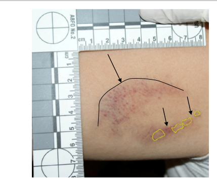
Figure 4: Dental features individualized from the pattern of the bite mark: yellow circles form the left side to right side of the image: teeth 41, 31, 32 and 33.