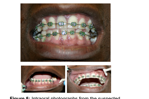
Figure 5: Intraoral photographs from the suspected.

and 33. The arrow between teeth 41 and 31 indicated the diastema and the contusion area. The arrow between teeth 32 and 33 indicated the other diastema. The upper arrow indicated the generalized contusion compatible with a upper lip (Figure 4).