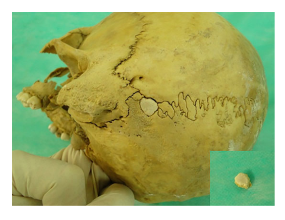
FIG. 4—Wormian bone totally positioned in the left squamosal suture. Note the perfect fitting in the supposed entrance orifice caused by firearm. The small Wormian bone can be observed at right edge of the figure.

gunshot entrance wound and mislead the anthropological study, especially if the WB is not in position during the initial analysis of the cranium, as seen in the case described above.