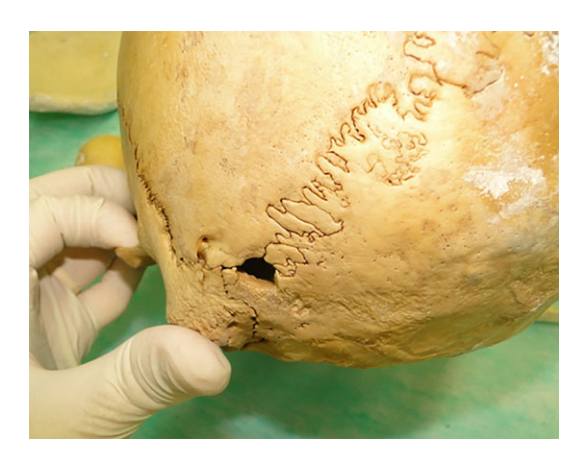
FIG. 1—Round orifice with punched-out appearance located in the left squamosal suture suggestive of entrance of projectile firearm.