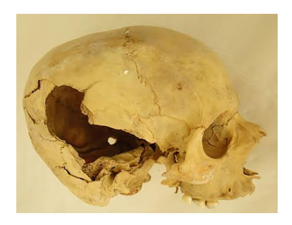
FIG. 2—Extensive irregular fracture with loss of substance in the right temporal–parietal region suggestive of exit hole of projectile firearm.

Specific features commonly allow for the recognition of entrance wounds in bones (14,15). A typical round or ovoid sharp-edged hole with punched-out appearance, slight flaking at the edge, smaller and more regular than the exit wounds is usually found in firearm cranial entrance injuries and quite well described in the forensic literature (14,15). However, the displacement of WB can generate an orifice quite similar to a