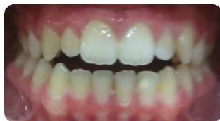
Anterior Open Bite