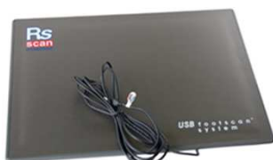
Posturographic platform – RsScan footscan

With the purpose of observing the presence of CB and/or OB an intra-oral evaluation was preceded in young athletes, of football and basketball, between the ages of 11-19 years old. After we measured the static postural behaviour with a posturographic platform – RsScan footscan . The posturographic variables analyzed were Area (mm 2 ) of Centre of Pressure (CP), CP's total Distance (mm) and the distribution of anterior-posterior and medial-lateral plantar pressure, for a period of 20 sec. It was also applied a questionnaire to assess the occurrence of Non-traumatic Injuries for each athlete.