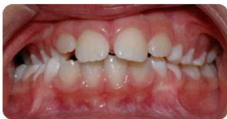
Unilateral Posterior Crossbite

Many studies suggest there is a close relationship between stomatognathic system and posture, and that crossbites (CB) and open bites (OB) are malocclusions which may influence other human body structures capable of changing the athlete's static posture and balance capacity. This condition can promote the occurrence of Non-traumatic sports injuries (those which occur without the intervention of any external factors).