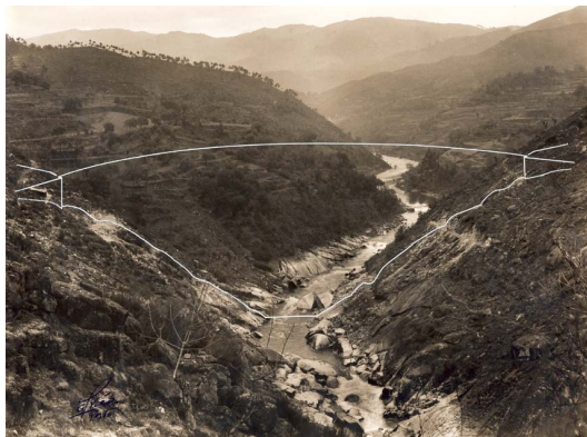
Img_01_Casa Alvão_1951_Location Caniçada Dam

The aim of this essay is precisely that of analysing the potential of photography as a tool for the development of new interpretations of the theory, criticism and history of modern architecture, with particular focus on a specific moment at the beginning of the second half of the 20th century during which several hydroelectric plants were built in the north of Portugal, interventions which led to the construction of a variety of new landscapes on national territory.