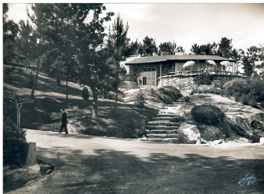
Img_06_Casa Alvão_1956_Restaurant Caniçada

exist in a constant relationship with those of the past, 4 conceived a series of settlements and power stations that developed a dialectic relationship with the landscape, which the art of photography was able to register and reveal.