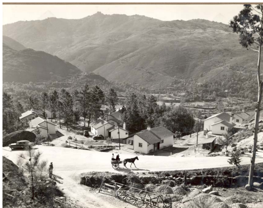
Img_04_Casa Alvão_1952_Caniçada Village

In these photographs we can see the sparse vegetation and the natural way in which that vegetation grew, in a landscape dominated by huge outcrops of rocks and where the absence of any construction is deliberately noted. This type of vegetation is distinct from that observable in the photographs taken at the end of construction, when the buildings are surrounded by recently planted small trees and flower beds, illustrating a new reality that is very different from the one that existed previously.