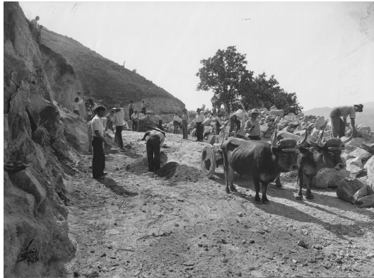
Img_03_Casa Alvão_1947, Construction access to the Power plant of Venda Nova

Despite the fact that photography had, at that time, placed the visual image at the service of the power of the state, today, more than 60 years later, the photographs that were taken allow us to understand some of the changes, changes which cannot be understood by looking at minutes of HICA board meetings, (in which progress on the construction sites is described in great detail) nor by reading the main texts published by the government which simply glorify the size and modernity of the finished work.