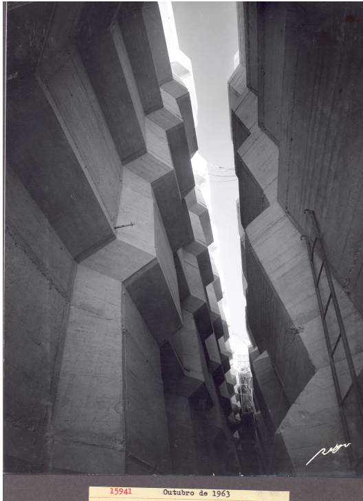
Img_07_ Teófilo Rego_1963, Alto Rabagão Dam

Teófilo Rego on the other hand focusses his images on people and their relationships with the buildings. With the exception of some of the images of the inside of the pousadas and houses, decorated throughout by HICA and with everything ideally placed so as to be ready for use, in the photography of Teófilo Rego the new inhabitants are a common presence.