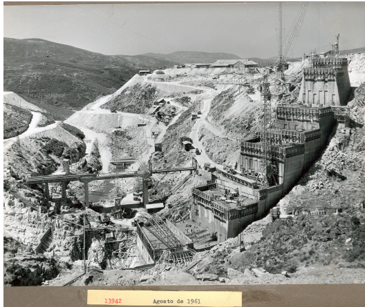
Img_02_Teófilo Rego_1961, Alto Rabagão Dam