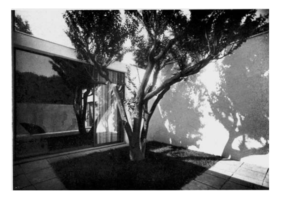
Figure 4. Luigi Figini and Gino Pollini, Villa-Studio for an artist, Milan, V Triennale, 1933. Published in Alberto Sartoris, Encyclopédie de l' architecture nouvelle, vol. 1, Milan, Hoepli, 1948 and later in Sabatino, 2013.

In the 1930s, the debate in Italy focused on the classical-vernacular Mediterranean patio-house . This house type, characteristic of the Mediterranean region since Ancient Antiquity, "proved to be adaptable to the functional requirements of modern dwelling, but it also facilitated a typical Mediterranean lifestyle that involved spending part of the day in the open air" (Sabatino, 2013: 201). That is to say, it responds to the necessity of an external existence of controlled intimacy.