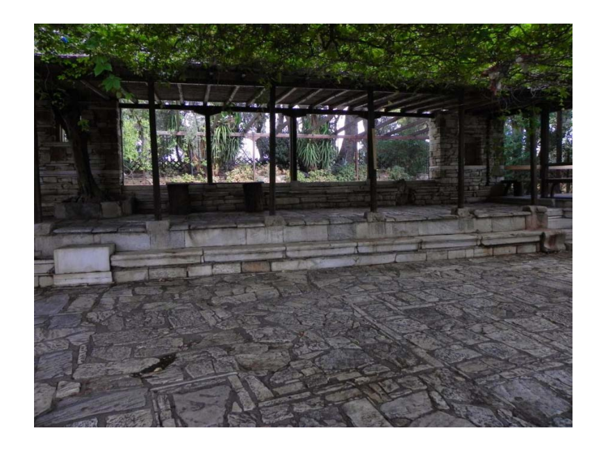
Figure 2. Dimitris Pikionis, Acropolis paths

Vieira de Almeida, who created this concept, quoted in this respect Eglo Benincasa, who explained that the relation with the external is very different between North and South, corresponding to distinct lifestyles. For the Southern man, life in the open air doesn't translate the necessity of contact with nature that is essential further North. In the South the life in the open are air evolves "in an open space protected from the Sumer sun and the Winter wind, we can call it as semi-open". Thus, from his point of view, "a problem that should be of great significance in Southern architecture is to keep the maximal intimacy in open environments." (Benincasa apud Almeida, 2013 [1963]: 92).