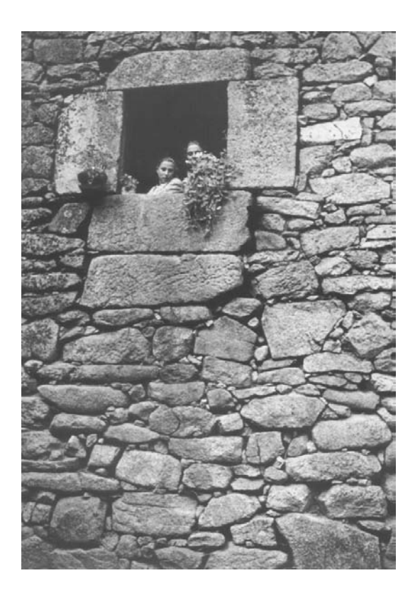
Figure 1. Beira Alta house.

For Marinetti, the vernacular architecture of Capri offered beauty and freedom, as it rejected "any kind of order reminiscent of classicism" (apud Sabatino, 2013: 208). Nevertheless, we argue that the classical tradition was eventually always present in of Southern architecture at its own right or through its vernacular reflex.