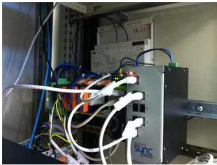
Figure 4 – Equipment installed for the demonstration project

Communication with ABB Protection Relays (3 x REL511 and 3 x SPAJ140C) was performed via SPA Bus Protocol and used a serial port of SYNC2000 (SPA Bus Master) for this purpose. Following features were successfully implemented / tested: