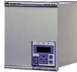
Figure 3 – ABB's REL 511 *2.5

In order to field test the developed solution, a Substation was chosen based on the following criteria: