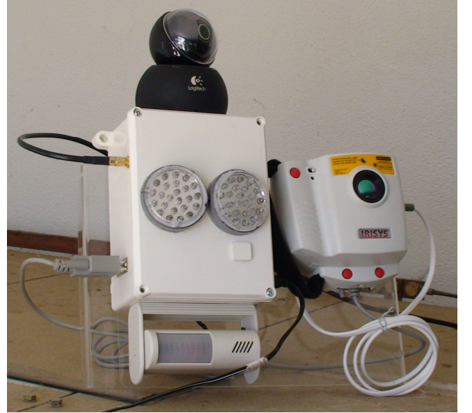
Fig. 4. Sensor node with web camera, light, motion detector and infra-red camera.

The sensor node to be deployed in MV/LV power transformer locations is shown in Fig. 4. The Webcam is a Logitech Quickcam Sphere AF that supports pan and tilt. A passive infrared motion detector sensor detects intrusions in the premises and triggers an alarm to start the video. LED lighting may be used during the night. An additional infra-red camera provides a thermal image of the power transformer to detect hotspots and prevent problems. An external outside antenna is used to improve radio link quality. Permanent 230V power is available at this kind of location, so energy is not a limitation for this particular node.