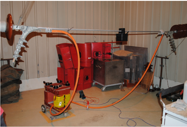
Fig. 2. Laboratory testing of a wireless sensor node (hanging on the line).

The next section presents an overview of related work. Section 3 presents an energy analysis of the sensor nodes used, based on real measurement with our setup. Section 4 presents an analysis of the video streaming operation and the energy and QoS management system. Section 5 presents conclusions and further work topics.