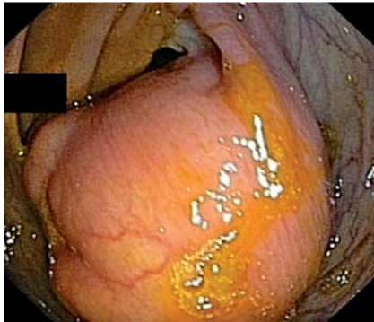
Fig. 1 Endoscopic view of the large, subepithelial, broad-based, polypoid mass with smooth, yellow surface in the ascending colon.