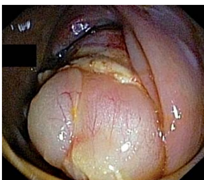
Fig. 3 Fat seen extruding from the mass after the unroofing procedure.

A 52-year-old man with a 1-year history of lower abdominal pain and constipation was referred to our unit for endoscopic resection of a large lipoma in the ascending colon, which had been detected by abdominal computed tomography (CT). Colonoscopy revealed a 50-mm, subepithelial, broad-based, polypoid mass in the as-