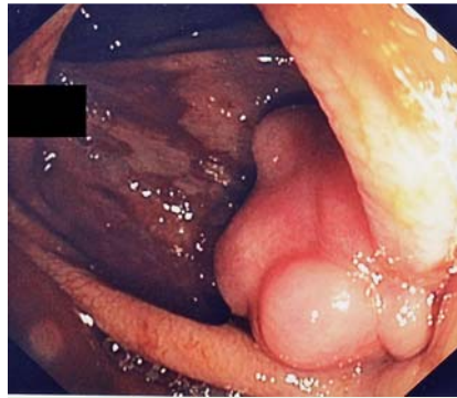
Fig. 5 Follow-up endoscopy 3 months later showing scarred mucosa at the resection site.

ending colon (● Fig. 1). Using an electrocautery snare, we transected the upper third of the mass to unroof the lesion (● Fig. 2). Fat was observed extruding from the cut surface, consistent with the diagnostic hypothesis (● Fig. 3). There were no procedure-related complications. Histopathologic examination of the excised specimen confirmed the diagnosis of a lipoma. A follow-up endoscopy 1 month later showed a small ulcer at the resection site (● Fig. 4), which was completely scarred 3 months later, with no evidence of residual lipoma (● Fig. 5).