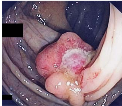
Fig. 4 Follow-up endoscopy 1 month later showing a small ulcer in involution at the resection site.

A 52-year-old man with a 1-year history of lower abdominal pain and constipation was referred to our unit for endoscopic resection of a large lipoma in the ascending colon, which had been detected by abdominal computed tomography (CT). Colonoscopy revealed a 50-mm, subepithelial, broad-based, polypoid mass in the as-