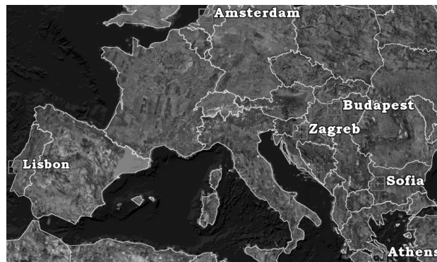
Figure 2 IPv6-enabled IPPM probes.

Aligned with the goals of this paper, we only consider measurements over paths including Lisbon on its origin or destination. On the five paths inside Géant2, independent on the direction, OWD values are very similar in IPv4 and IPv6, with slightly higher average values on IPv6 measurements (below 10%). On the Sofia-Lisbon and Lisbon-Sofia paths average OWD values suddenly increase and some hours later decrease to previous values. Both IPv4 and IPv6 data show this pattern. Regarding packet loss, data present on the samples does not show any distinguishable difference between the IPv4 and IPv6 network.