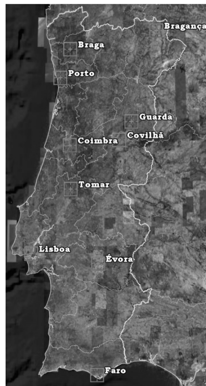
Figure 1 Geographical Distribution of IPv6-enabled Probes in RCTS.

Currently, twenty-six probes are operational. However only a subset is running IPv4 and IPv6. The high capacity probes have been installed in Lisbon and Oporto, taking into consideration RCTS' dual-star topology [11]. However, only the Lisbon high capacity probe is used for measurements. For the purpose of this work, we consider data collected from ten probes that are running both IPv4 and IPv6. The remaining set of probes could also be running IPv6 over tunnels, but the application that sets the measurements imposes the use of a physical interface (eth0). This restriction implies that the virtual interface (sit1) used to create the tunnel endpoint on a probe itself cannot be used for measurements. The NetWarrior 100 (low-end) IPv6 active probes accountable for this work have been geographically distributed over eight cities along the country, in addition to the central network nodes located in Lisbon and Oporto, as depicted in Figure 1.