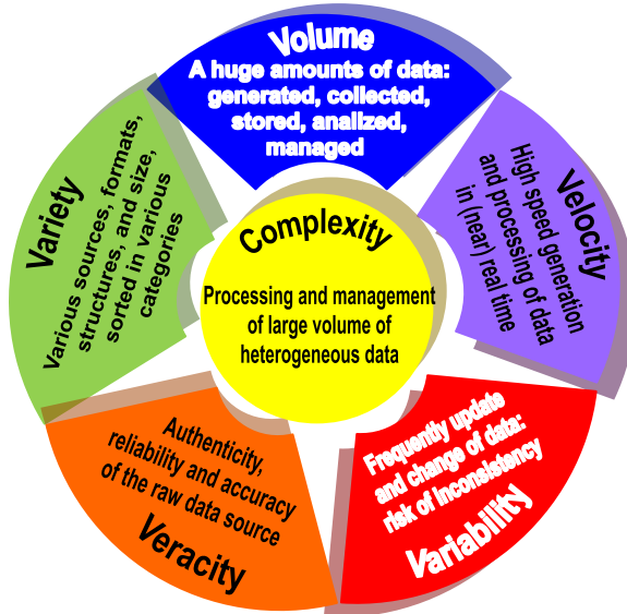
Figure 1. Educational context of Big Data

Collection, analysis and management of the huge amounts of educational data have to be consistent with their specific characteristics (Figure 1). From an educational viewpoint the term „Big Data” encompasses the following aspects [1]: