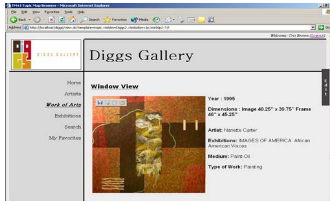
Figure 2. Diggs Gallery Portal: An artwork view.