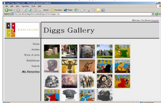
Figure 5. Diggs Gallery Portal: A personalized entry page for a registered user.