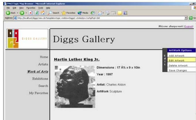
Figure 3. Editing functionality in the Diggs Gallery Portal.