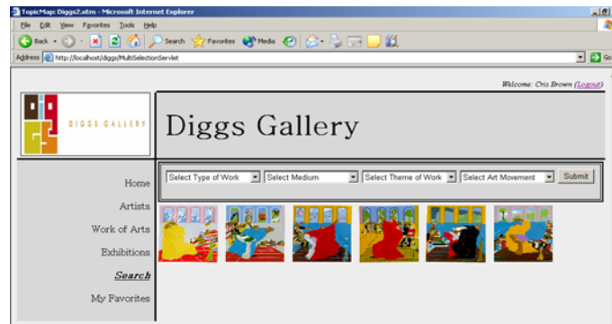
Figure 4. Searching Diggs Gallery Portal.