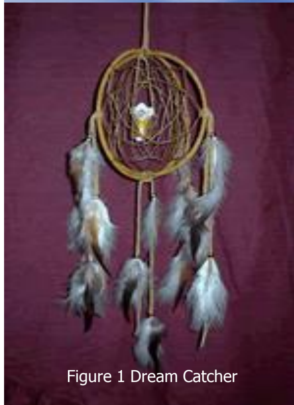
Figure 1 Dream Catcher

All things are connected. We did not weave the web of life. We are but a strand in it. Whatever befalls the earth befalls the people of the earth.