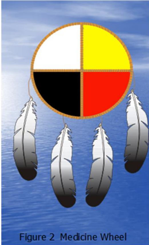
Figure 2 Medicine Wheel