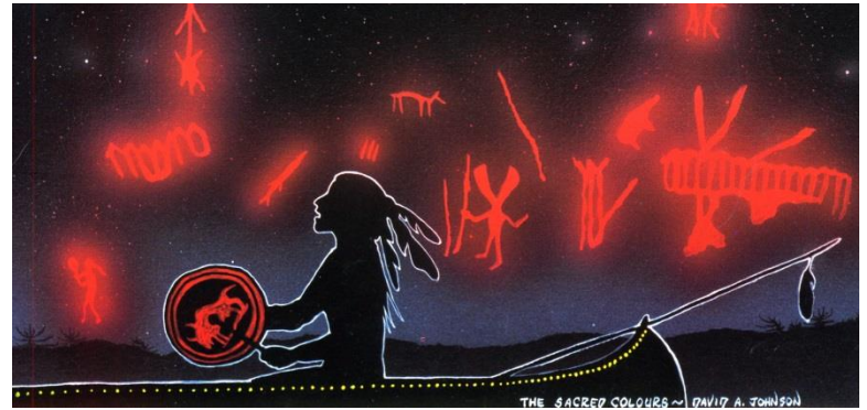
Figure 3. Nanabush pictograph from Bon Echo Provincial Park (Friends of Bon Echo Park, 2000) and The Sacred Colours by David A. Johnson of Curve Lake (Johnson, 2006, p.2).