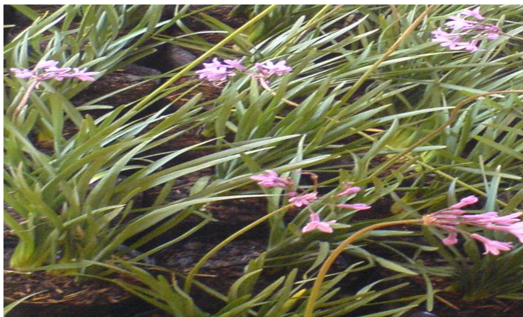
Figure 1: Tulbaghia violacea (with green leaves and purple flowers)

T. violacea has been postulated to have similar secondary metabolites and hence biological activities as garlic since they belong to the same family; and both have the characteristic sulphur smell associated with garlic [23,24]. Sulphur compounds have been isolated from both garlic and T. violacea , and are credited with the medicinal properties of garlic [25,26]. These sulphur-containing compounds are produced when alliinase, an enzyme present in all plants belonging to the Allium species, reacts with alliin when the plant is bruised/ crushed [25]. Numerous odour forming compounds [25,26] and bioflavonoids such as quercetin [27] have also been isolated from extracts of T. violacea . The optimum pH for activity of alliinase from both garlic and T. violacea is 6.5, and that for onion 8 [28].