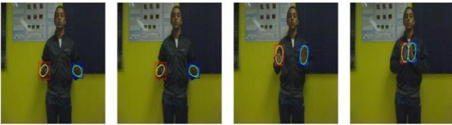
Figure 2: The tracking process output.

This equation therefore asserts that by keeping all other parameters the same, the predicted ellipse will maintain the same direction and magnitude of translation on the image plane. These parameters are however updated when the skin-coloured pixels in an image are assigned to the predicted ellipse. The updated parameters can therefore be used as a good indication of the size and angle of each in the current frame. Examples of the tracking process output are shown in Figure 2.