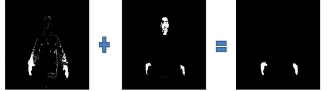
Figure 1: Logically AND-ed motion and skin image to form the motion-skin image.

After applying the connected-components labelling algorithm, the skin clusters are identified in a 2D binary image. To identify only the skin clusters that are of interest, such as the hands, a background subtraction algorithm is applied to the image sequence. The background subtraction algorithm is based on a mixture of Gaussians that constantly updates the background model in every frame. This results in a foreground mask. This mask is logically AND-ed with the skin detected image to produce a combined image that only highlights skin clusters that have moved, as seen in Figure 1.