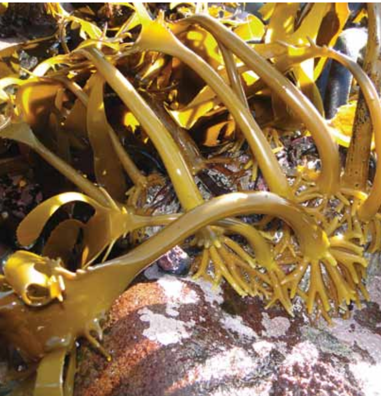
ABOVE: A clump of juvenile kelp plants showing their typical root-like holdfasts, stem-like stipes and blades formed at the distal ends of the stipes.

of being multiple-bladed; hence its common name. Adult plants of L. pallida also differ from those of E. maxima in that they have warty stipes as opposed to the smooth stipes of E. maxima .