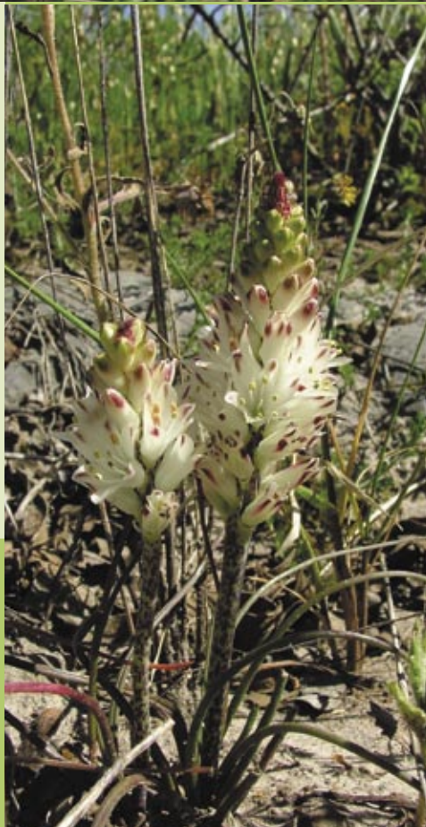
TOP: Gladiolus alatus (kalkoentjie). RIGHT: Lachenalia orthopetala (viooltjie). BOTTOM LEFT: Pterygodium catholicum (moederkappie). BOTTOM RIGHT: Haemanthus pubescens (blood flower, poeierkwas).

“It is hard to believe that there are no clear guidelines on the optimal management of our public open spaces.”