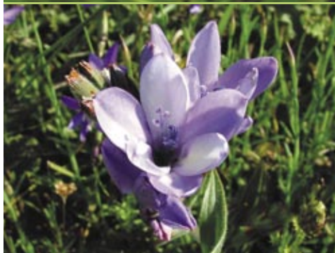
ABOVE: Moraea villosa (blouflappie, peacock moraea).