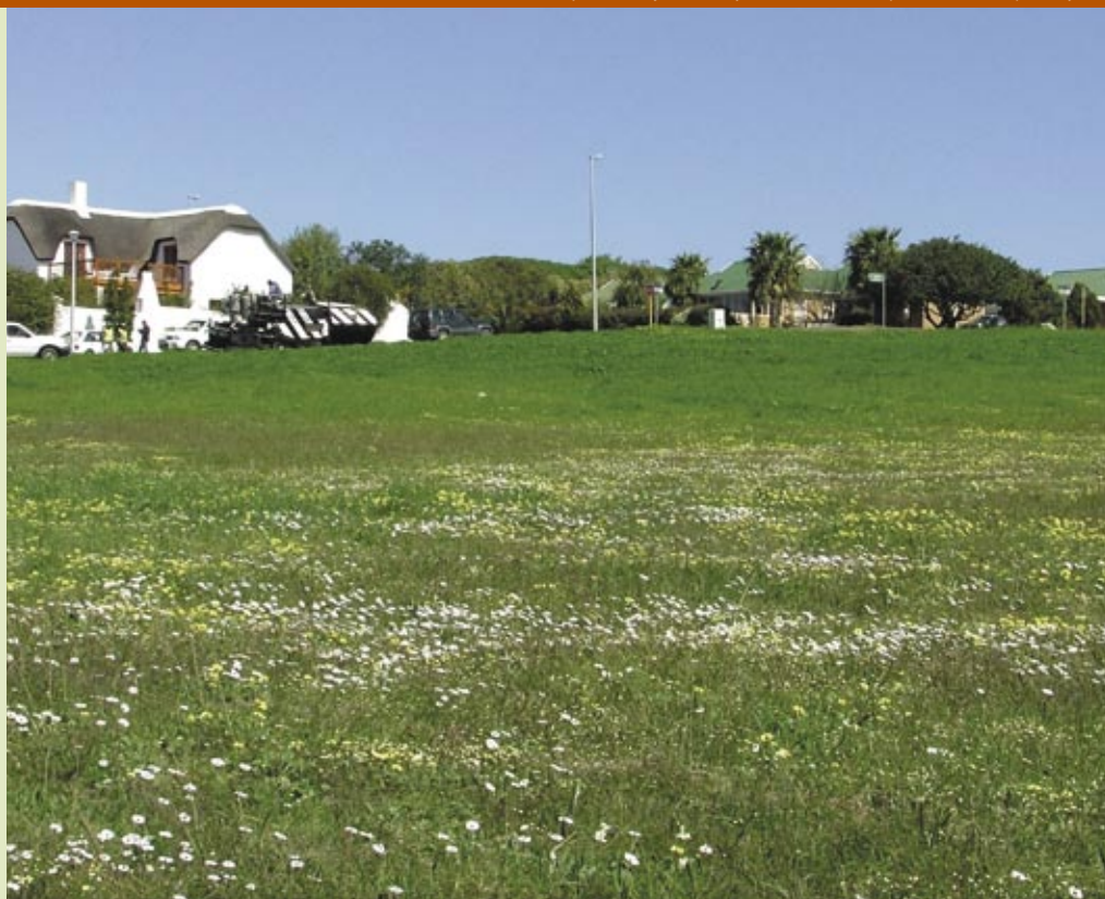
Spring flowers with encroaching Kikuyu grass in the background, St John Street.

Cape Town's precious lowland remnants need more formal recognition and protection