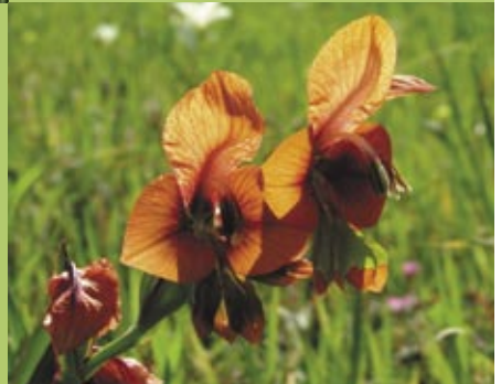
BOTTOM RIGHT: Sparaxis villosa (bloukappie).