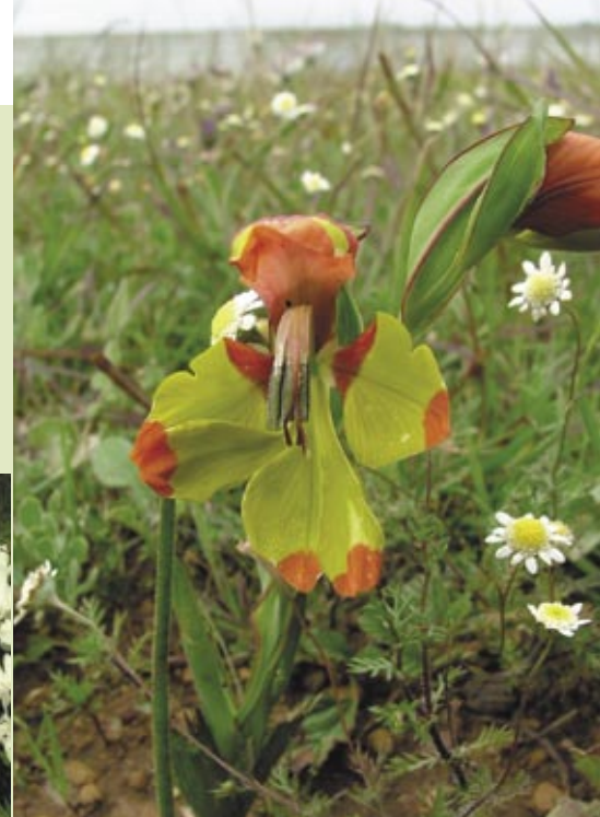
ABOVE: An unusual variety of Gladiolus alatus (kalkoentjie).