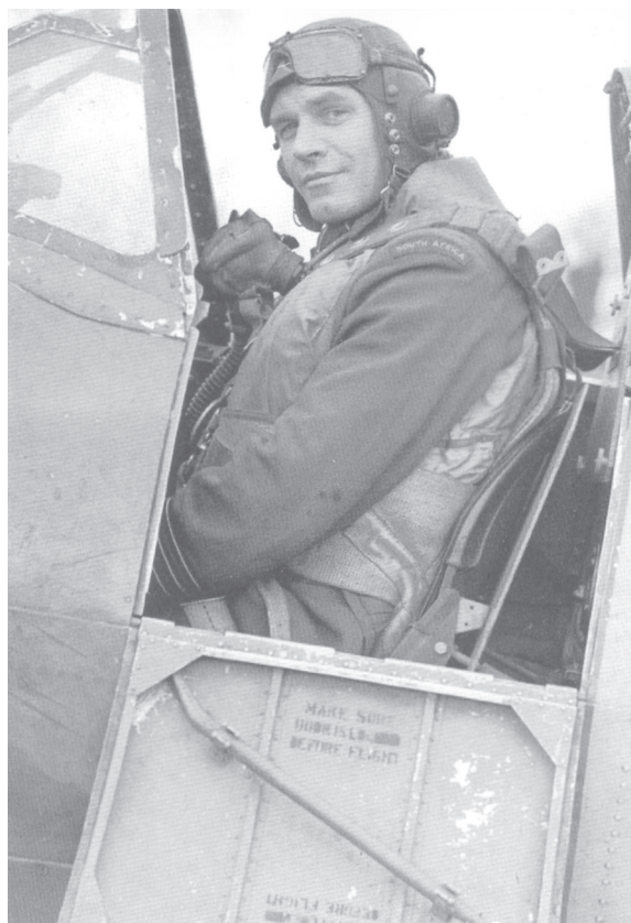
Figure 6: Fighter Boy: A.G. Malan before Flight, 1940

In describing Malan as a major asset, Dowding knew what he was on about. Fighter Boys like Sailor Malan and other colonial supermen like Al Deere ‘were extraordinarily good for morale’, emerging ‘from the anonymity of their squadrons’ to find themselves ‘on the way to becoming national figures’, 30 faithful outer men of Empire who joined Britons in swarming into the core of national consciousness. With the crucial nature of their defensive role having been underlined forcefully by Churchill, the eminence of Fighter Command was widely recognised, especially its value for instilling in the population a sense of self-belief and staying power. Predictably, Malan was prominent among those who were lifted out of the restrained collectivity of their squadron identities and fashioned into famous individual figures, cocky and adored fighting personalities who were snapped sipping sherry with King George VI or waltzing around London ballrooms with actresses. 31 It was the devil-may-care conceit of a modern imperial identity, and that of a metropolitan ‘insider’.