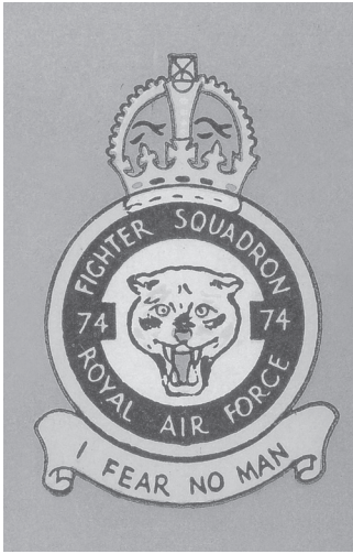
Figure 4: RAF No.74 (Tiger) Squadron badge