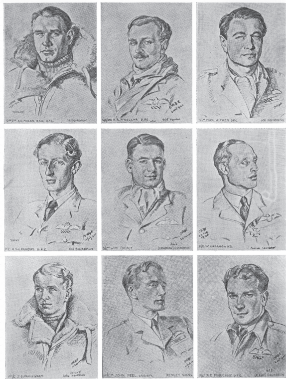
Figure 5: Battle of Britain Fighter Aces: Pose and Poise