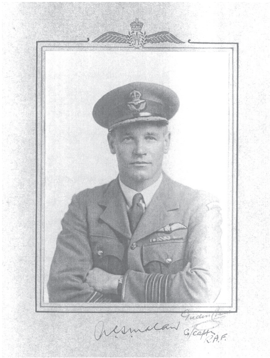
Figure 3: Mess Wall Marauder: Official Portrait, Group Captain A.G. Malan, 1940s

inclusive society, developing on the basis of some liberal softening of the segregationist racial order. 17 To congeal within the ranks of murmuring and uneasy returned war veterans, it required a trigger. That was an apartheid National Party and it was soon pulled by its 1948 electoral victory. Naturally, Malan was aghast. His country, he wrote to a former British pilot with whom he had once flown, was now in danger of ‘losing its ticket’ to remaining in ‘the company of the civilised nations of our world’, the ‘humane’ world of ‘decent values’ that had prevailed in 1945. 18