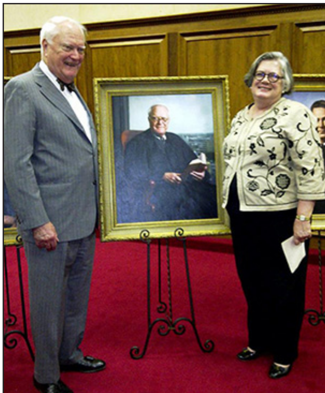
Judge and Marcia Tjoflat Portrait Presentation from the Fourth Judicial Circuit Florida State Court, April 2011. The portrait now hangs in the new state courthouse in Jacksonville.

are kept on file with the author. Unless noted otherwise below, the quotes from Judge Tjoflat are from these materials and are not specifically noted in the reference section.