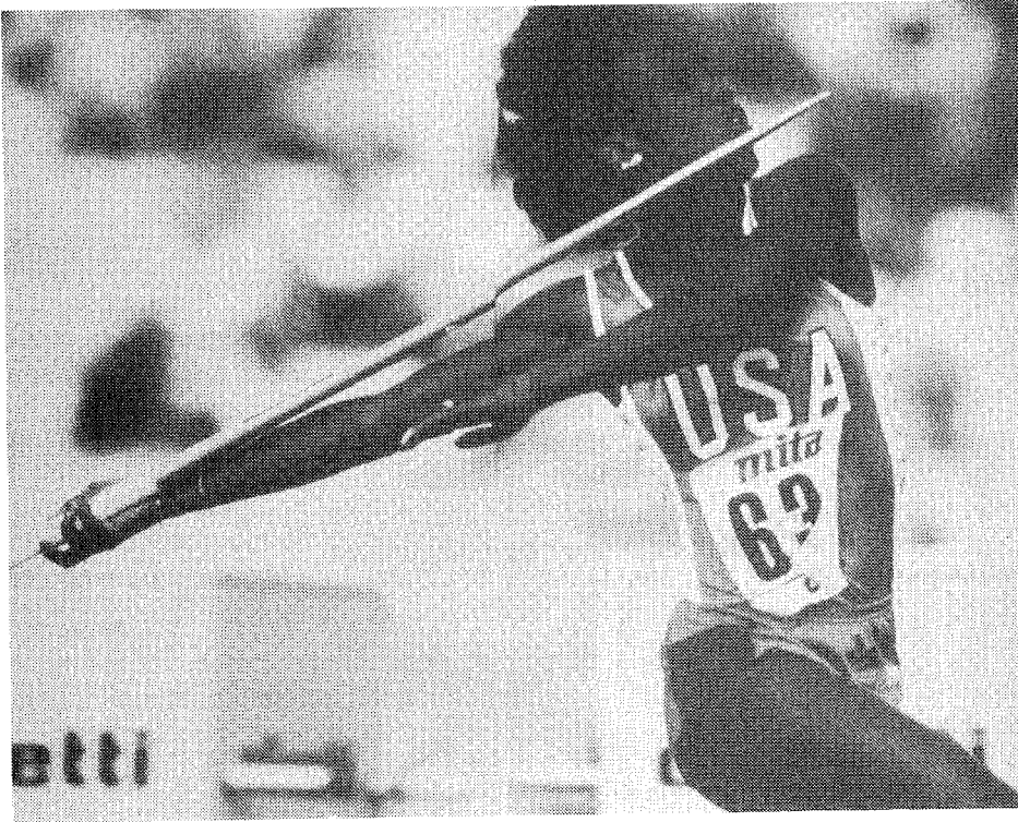
Figure 3: An Example of The Reality of Women's Sport Participation: Jackie Joyner-Kersey in the 1988 Olympics. (See Kenny Moore, SPORTS ILLUSTRATED , Oct. 3, 1988, at 29. "Proving her point. Jackie Joyner-Kersey fulfilled expectations in winning the heptathlon." Id. )