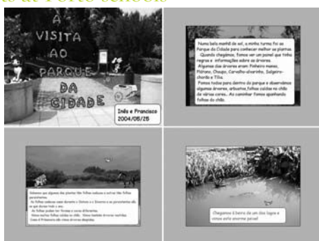
Picture 3 - Writing about a visit to the city park, from Escola da Vilarinha, Porto.