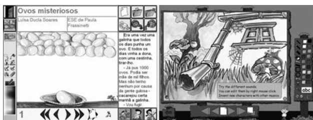
Picture 4 - From the first stable prototype to version 031.

Creative Writing co-laboratory evolved from first stable prototype until final version mostly with the co-design jointly effort of children, trainees, teachers, researchers, designers and programmers. This is the first main conclusion: the relevance of co-design for the achievement of suitable products for education.