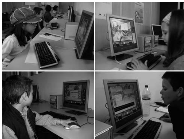
Picture 2 – Family Group at Coimbra, trying the synchronous collaborative features.

We found in first session that we have a competitive group, a collaborative group and a cooperative group.