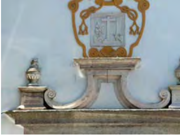
Leading Researcher Fernanda Olival

The aim of this project is to analyse the ways in which the intermediate groups (those situated between the popular groups and the nobility) struggled to obtain the right to serve as 'familiares' of the Inquisition; how they capitalised on this singular distinction in different contexts, and what kind of social profiles they have.