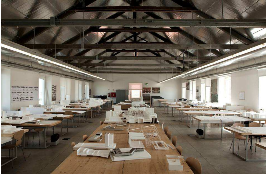
FIG.1: The design studio in Leões, University of Évora