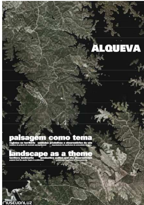
FIG.2: Landscape as a theme was the name of the exhibition at the Museu da Luz