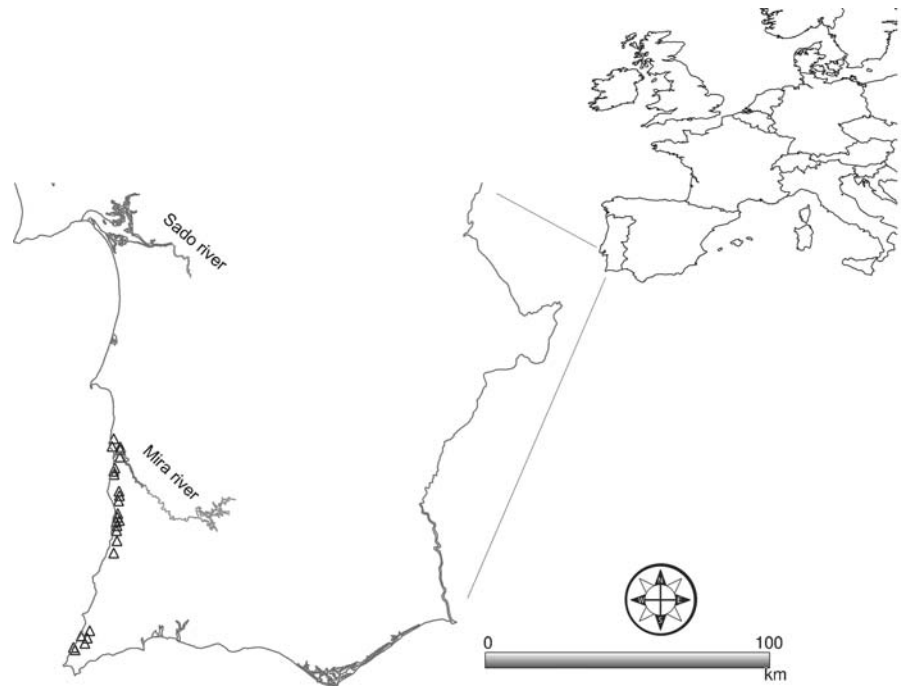
Fig. 1 Location of the 29 sampled temporary ponds. Map layout created with Quantum GIS

traditional land uses in the regions were extensive agriculture and livestock pastures in rotation. Presently, some 12,000 ha are administrated by a hydrological plan to further develop agricultural activities. In 2006 and 2007, fodder and maize occupied the largest areas, around 18–20% each (ABM, 2007, 2008).